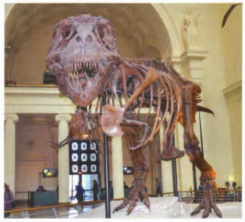
Check out the world's largest T-Rex skeleton at the Field Museum, catch the dolphin show at the Shedd Aquarium, and then spend some time viewing the stars and planets at the planetarium.

Book a room as high as possible and on the lake side for the best view of the lake and the city - we had a corner Executive Suite and enjoyed a 180 degree view of both out of two huge windows. With a walk-in closet, two big flat screen televisions, a small fridge, and a separate living room and bedroom area, it's a great room to use for your getaway. Plan at least one meal at Shor, a contem-