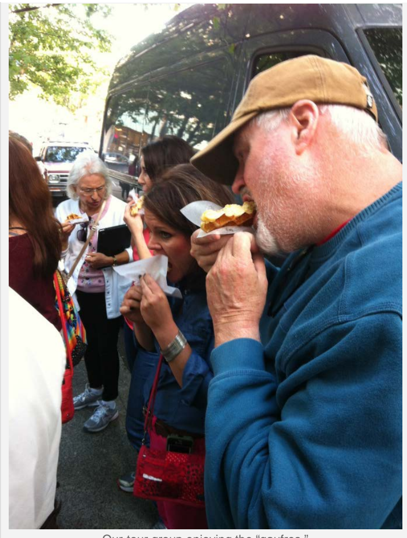
Our tour group enjoying the "gaufres."

The toppings are also chosen with care and made with only fresh, local, organic and seasonal ingredients. For a great introduction, try the original liege waffle simply dusted with powdered sugar to fully appreciate how delicious these waffles are on their own, which is what we had for a sample. But I looked so yearningly at the other offerings on the menu that my husband took pity on me and we walked back over to The Gaufre Gourmet for breakfast the next morning and I had the Belgian chocolate drizzled waffle which I highly recommend. I could cheerfully eat there every single day until I had tried every waffle – then start again!