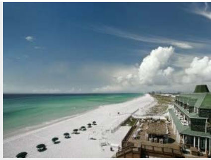
The charming Henderson Park Inn right on the seashore.

Tagged as: bed and breakfast , free breakfasts , hotels