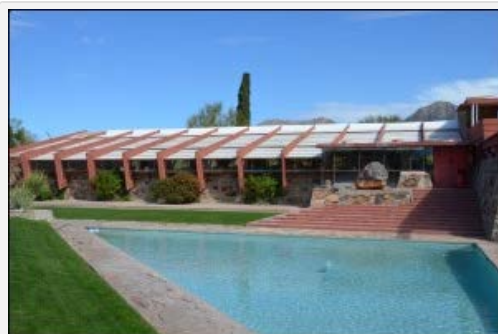
Frank Lloyd Wright's winter home.

really enjoyed our fireplace in the evenings! Spend one morning touring Taliesin West , Frank Lloyd Wright's desert architectural masterpiece. The 90-minute tour is fascinating, but make sure you leave time to stroll around the grounds and visit the wonderful, large gift shop. Head into Phoenix for lunch at Cibo , a darling little neighborhood bistro. Park on the street and eat outside on the lovely patio – the hot sandwiches are delicious!