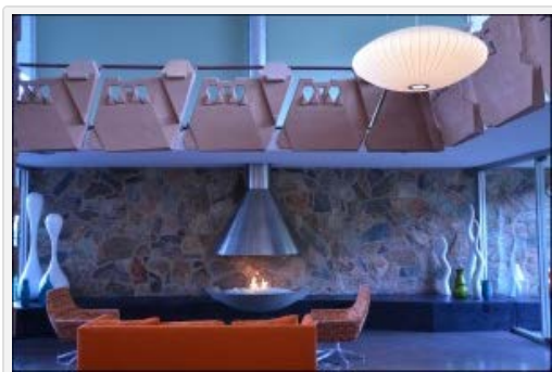
Lobby at the Hotel Valley Ho.

lounge chairs. Have a meal at Zuzu's on the patio overlooking the pool and enjoy their comfort food-designed menu – I recommend the tomato soup with croutons made of tiny grilled cheese sandwiches!