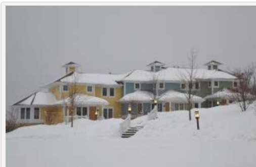
Condos at Crystal Mountain.