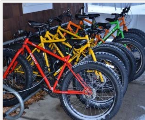
Fat Tire Bikes at Crystal Mountain.