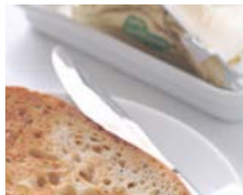
Cork for Foodies