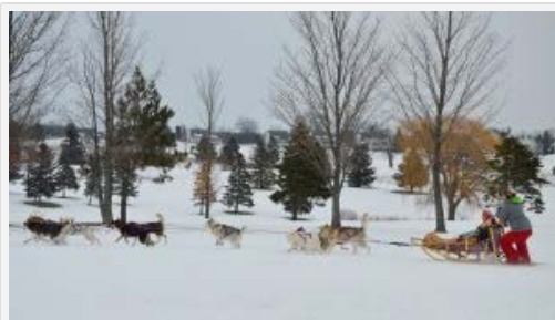
Dog Sledding at The Grand Traverse Resort.

Yeah, traffic may be backed up because of those drivers who are freaked out by ice and snow, the temperatures are so low you simply can't put on enough clothing, and school has been called off yet again. Why not forget about all that and actually enjoy this fabulous winter? This is pretty easy to do if you head to Michigan to check out three equally marvelous resorts, all of which provide enough winter sports fun to make you think that winter might turn out to be your favorite season after all.