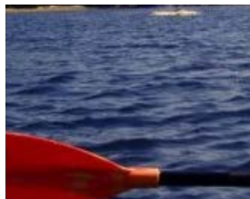
Kayaking with Killer Whales in Johnstone Strait