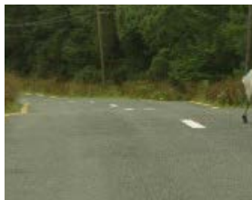
OLYMPUS DIGITAL CAMERA