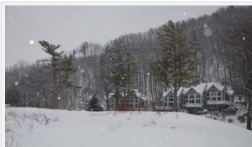
Snow Scene at The Homestead