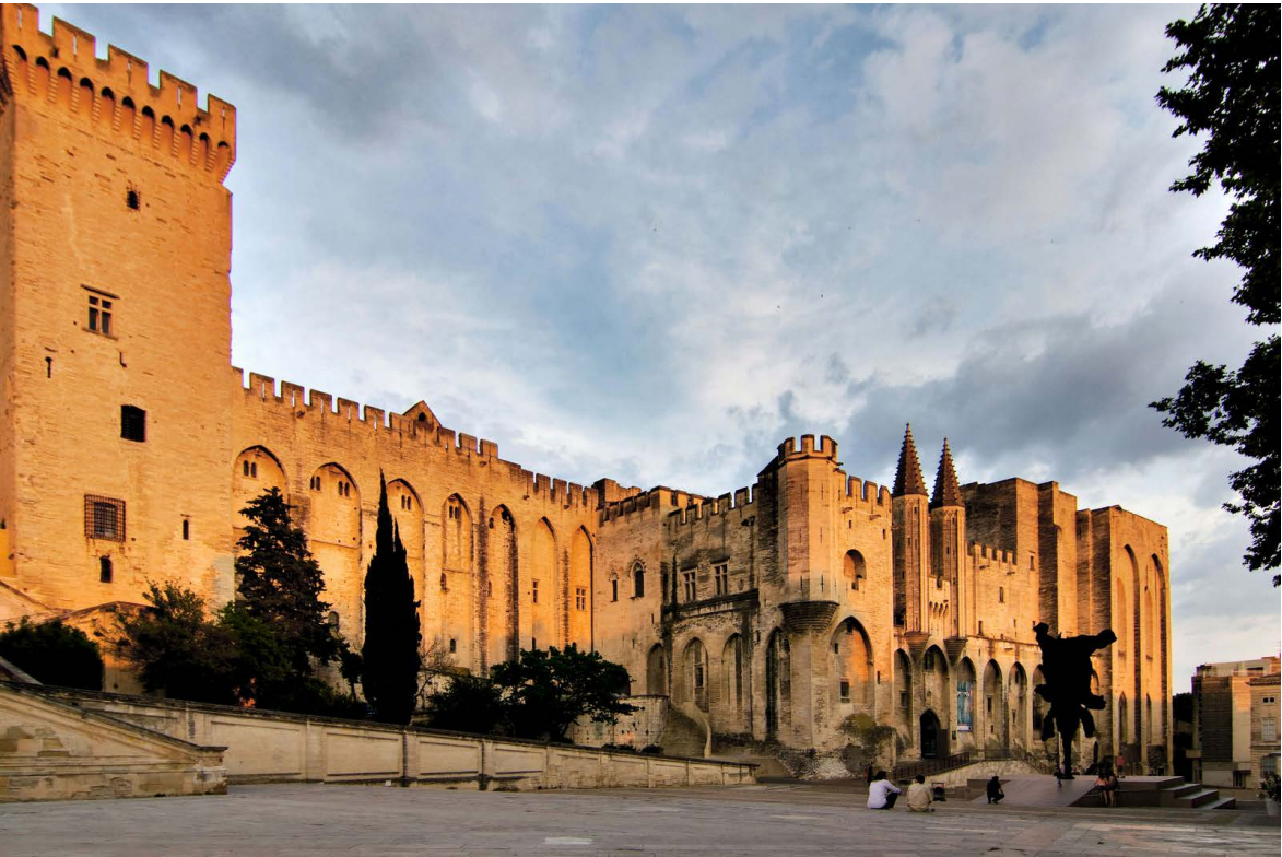
Palais de Papes

A perfect introduction to the city and a great amenity for kids is Le Petite Train d'Avignon , a miniature trolley like train which leaves from the Palais de Papes on a 40 minute tour of the city and includes medieval streets and neighborhoods along with the Pont d'Avignon. Tickets are very reasonable and the tour is available in a variety of languages via headphones.