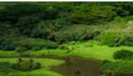
10 Places You Absolutely Need to Visit While the Kids are Young