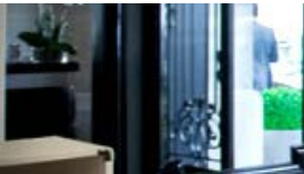
Affordable Family-Friendly Hotels in Paris