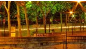
Things to Do for Christmas with Kids in Paris