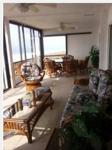
Fabulous porch at Crescent Royale condos.

3. Sarasota. Drive a few hours further down the Gulf Coast and you will find Sarasota and Siesta Key, voted the best beach in the United States. The white sand here is powdery soft and made from 99% pure quartz so it stays cool underfoot even on the hottest days. Make a reservation for the Crescent Royale condos in Siesta Key and you will be right across the road from the beach with a great view. We stayed in 7a which is a huge, four bedroom condo with an amazing, glassed-in porch that we found ourselves reluctant to leave. The recently renovated unit has a large living room with a state-of-the-art kitchen that includes a subzero fridge, granite countertops, and every amenity you can imagine. The pool is also nice when kids want a break from the beach. Just a few blocks away is the Siesta Key Village with lots of cute little shops and restaurants. Have dinner one night Café Gabbiano in the Village and be sure to order the lobster ravioli as it is to die for. If you are a wine aficionado, they have an amazing assortment of wines. Sarasota is