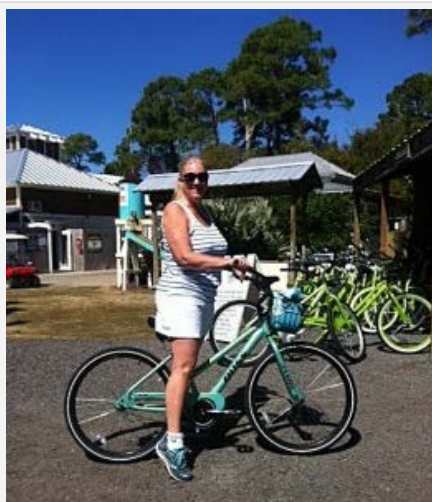
Biking at Sandestin.

Plenty of pools dot the resort but the beach is always a great way to entertain kids. The Village at Baytown Wharf offers a myriad number of things for kids to do from the free Adventure Land Playground to the Baytown Adventure Zone with fun activities like zip lining to the more sedate Baytown Carousel. They even have a complete arcade and laser maze. When you are ready for dinner, dress up a bit and spend the evening at Bistro Bijoux where you will have an amazingly delicious dinner. Be sure to try the shrimp and grits – you won't be sorry! If you want to go more casual, stop in Gringo's for some fresh tacos or burritos, all made with local and fresh ingredients. If you have a rainy day, spend some time at the Silver Sands Outlet Mall where you can find dozens of shops with some great deals.