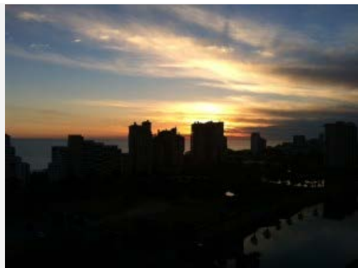
Nothing like sunset at the beach!

perfect place for families because of the beautiful beach and tons of fun activities. You will have your choice of accommodations, but the Laketown Wharf Resort is a perfect choice. With one, two or three bedroom condos, all furnished beautifully and all facing the Gulf, you will be very happy with your choice. They offer a seasonal Kidz Club for kids aged 4-12 with tons of fun things to do. My grandson especially loved the five pools and we