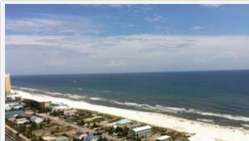
The amazing view at the Laketown Wharf Resort.

items floating in the lagoon for everyone to climb on. They also have kayaks and beach toys available at no extra charge.