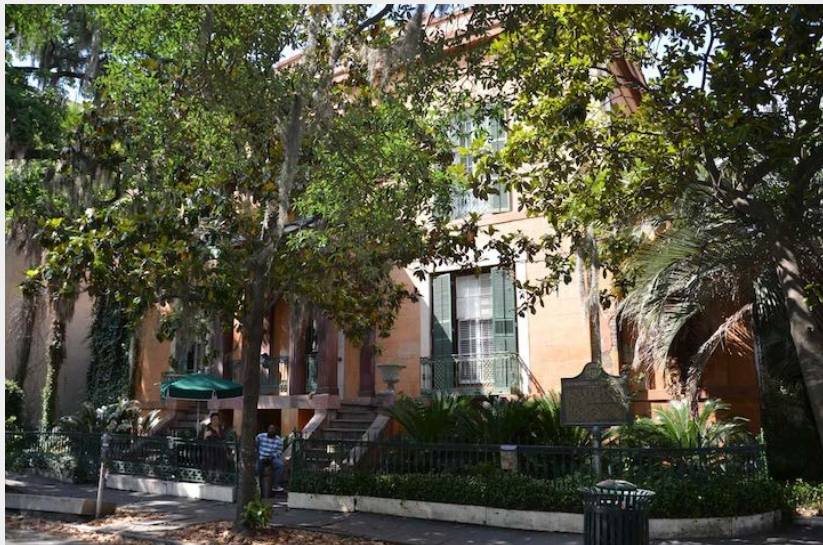
Filled with huge, gorgeous, live oak trees festooned with Spanish moss, Savannah is a truly lovely and unique city.

In a series of posts, I'm going to talk about some my favorite car-trip destinations – what we ate, where we went, where we stayed, and how we generally had a wonderful time. Because why go if you're not going to have a wonderful time?