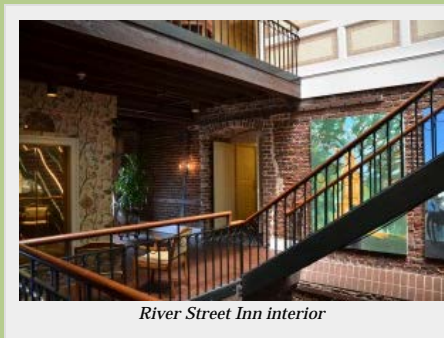
River Street Inn interior

The first time we stayed in Savannah, we were in town for the Tall Ships Challenge , which is an incredible story in itself. We were lucky enough to get a room at the River Street Inn . Fronting Bay Street and backing up to scenic River Street, this historic five-story hotel wraps around a central atrium and offers very spacious, lovely rooms. Our first room overlooked River Street and the busy river with ships sailing by. It was incredibly scenic, charming, and very, very noisy. We didn't sleep a wink!