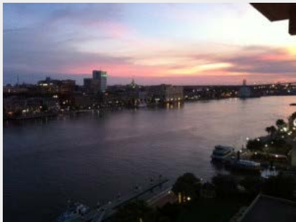
Sunset on the river

What are some of your favorite sights and places in this beautiful Southern city? Please share them with us (including links, if possible) in the Comments section!