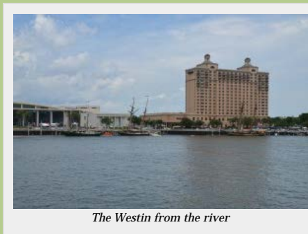
The Westin from the river

Before you leave the Westin, be sure to enjoy lunch or dinner at the Aqua Star . This lovely restaurant has huge windows overlooking the river and delicious custom-made salads and wraps. They will give you an itemized menu and you choose what you want on your salad or wrap from dozens of ingredient choices.