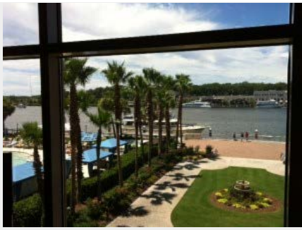
View from the Aqua Star restaurant

perfect little Tybee Island. Visit the famous lighthouse then have lunch at the Crab Shack . Order the “Low Country Boil” and enjoy some of the best shrimp and the sweetest corn on the cob you will ever eat! Then stroll out on Tybee’s Pier, have some ice cream, and pick up some souvenirs in one of the quirky little shops by the pier.