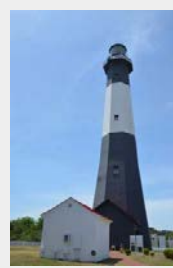
The Tybee Island Lighthouse