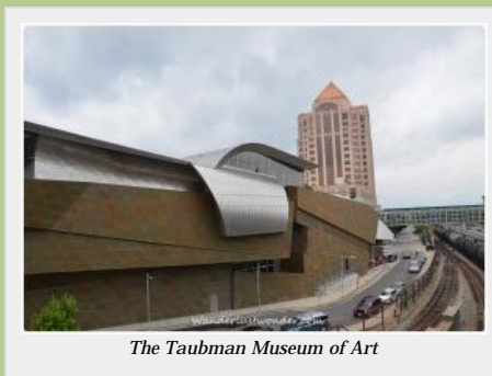
The Taubman Museum of Art

Then check out the incredible architectural marvel that is the Taubman Museum of Art . The museum is open and airy with a high, soaring ceiling and some incredible exhibits. They have a number of fascinating exhibits that change often. One of the most interesting was the Faberge show, which runs through January, 2013, and features absolutely gorgeous pieces – everything from clocks to jewelry.