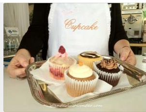
Viva La Cupcakes!

friendly town, Roanoke has plenty of bike paths. We spent a pleasant afternoon biking around one of the parks courtesy of River Greenway Bicycle Rentals . They carefully made sure our bikes were sized correctly, and that made our ride much more pleasant.