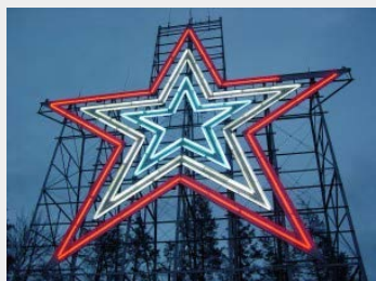
The big star that gives the city its nickname.

Still need more exercise? Head up to Mill Mountain for a look at the famous Roanoke star , which gives the city its famous nickname, "Star City of the South." Designed as a temporary Christmas decoration in 1949, it was so unwieldy (at almost 90 feet tall) and so popular that town leaders decided to just leave it there. Lit with white lights, the star is quite a sight and visible for up to 60 miles away. From the star, you can hit some of the walking trails around Mill Mountain or visit the nearby zoo or Discovery Center . Both would be great for families.