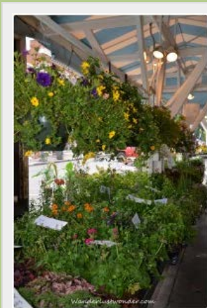
Roanoke City Market

You will have a number of choices of places to stay in Roanoke, but we found the Sheraton Roanoke Hotel and Conference Center to be the perfect place for seeing the area. When our room was just a little too close to the ice machine and we were concerned about hearing the sounds of dropping ice cubes at all hours, the staff immediately moved us to a much nicer room – truly the mark of an excellent hotel. They also offer free parking (a real plus; I just paid $23 a day to park at another hotel), free wifi, free Starbucks coffee in the rooms, a very nice complimentary breakfast, and very, very comfortable beds. And the hotel is located just a few minutes from downtown Roanoke with free shuttle service to the nearby airport.