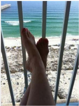
Relaxing on Navarre Beach

see them what's the best they can do. You often get the best price by dealing directly with property. When can also refer to when can you go ? Does it have to be when the kids are out of school? If you're a Baby Boomer, probably not. If you can travel in the low season, you're going to get the best prices. Many beach areas are perfectly lovely in May or September and you'll find some great deals.