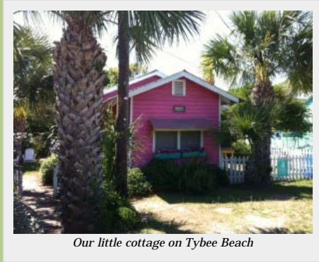
Our little cottage on Tybee Beach

Mermaid Cottages offers a wide variety of cottages all over the island in different sizes, styles, and prize ranges. They are lovely and interesting, many are just steps from the beach (ours is precisely 99 steps, apparently) and, best of all, many are very, very reasonably priced.