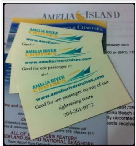
Tickets for our cruise.

We thought the lobby could not be topped, but when we entered our large one bedroom suite, we realized we were wrong! We were amazed to see a completely separate bedroom, a very nice living room, and a complete kitchen. It is the perfect place for a couple or even a family. There is even a nice sized balcony overlooking the town or the harbor, depending on which way your room faces. I spent an afternoon lounging by the marvelous pool, which overlooks the harbor, and we really enjoyed the free Continental breakfast every morning. They even provided a very nice lap desk in the bedroom, which is something I have never seen in any other hotel.