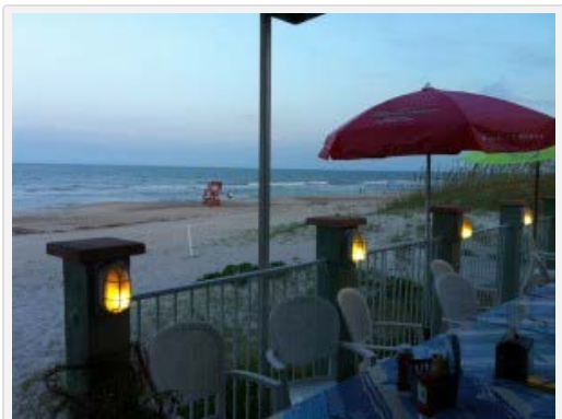
Evening beach view on Amelia Island.

Before we drove to the lovely and historic Amelia Island on the Atlantic coast of Florida, I had never heard of it. Amelia Island is one of the Sea Islands, a chain of barrier islands that reaches along the east coast of the United States all the way from South Carolina to Florida. It's only about 13 miles long and 4 miles wide, but it's a charming place full of beautiful Victorian mansions. It's the only location in the United States to have proudly flown eight different flags and, of course, it has the requisite pirate history of most barrier islands. This place comes by