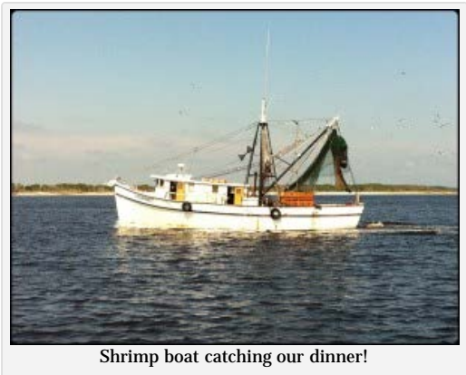
Shrimp boat catching our dinner!

As we consumed our delicious seafood and watched the sun go down, we marveled over how much we had enjoyed our visit to this fantastic little island – which we previously had never even known