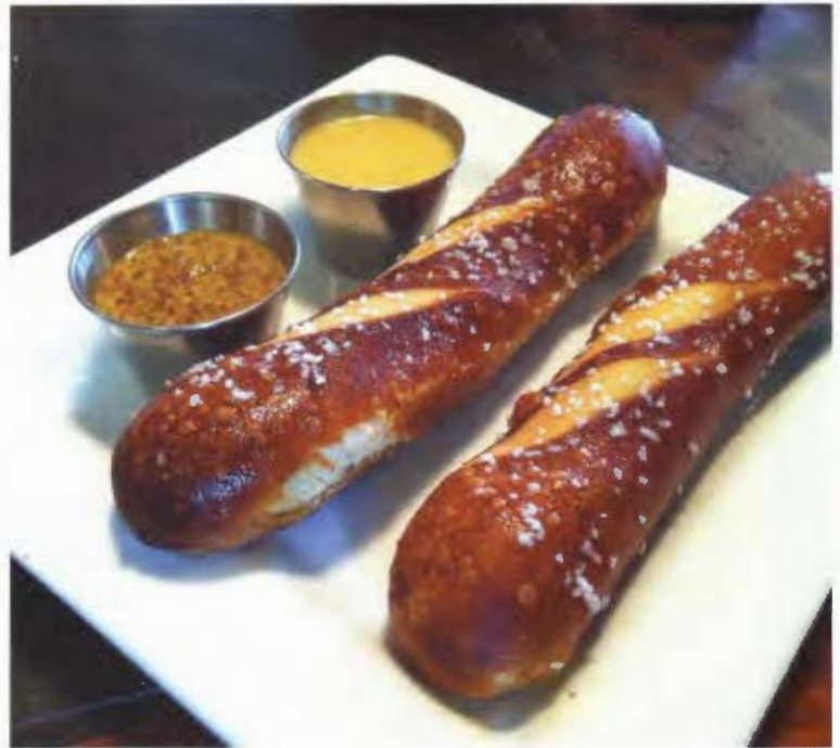
Don't forget to sample some of the local delicacies including the soft and fresh pretzels.

But before you even begin your tour of the sights of St. Louis, check into the Embassy Suites St. Louis – Downtown.