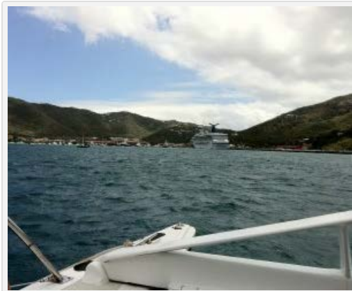
Sailing away from our cruise ship.

We watched our cruise ship disappear in the distance as we headed around the island to our snorkeling destination. We bounced along over the waves – it's a good idea to take Dramamine or Bonine if you are going on any kind of boat trip if you have a tendency to motion sickness – and finally turned into a quiet cove with water so clear we could easily see the sandy bottom through 20 feet of water. We felt very safe in our little cove with palm trees whispering softly in the tropical breeze along the edge of the water.