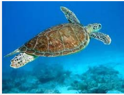
Sea turtle makes his way through the water.

If you have never snorkeled, give it a try the next time you have the opportunity. I have a feeling you will love it just as much as I do!