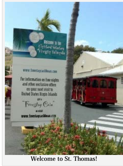
Welcome to St. Thomas!

It's easier to get the mask on if your hair is wet, so just wet it down then slip the mask over your head and face. Make sure the mask is good and tight, but not uncomfortable. It has to be tight to keep out the sea water so you can see everything underwater. If your mask gets foggy, just take it off, spit on the glass and swish it around in the water. Yep, that's right: spit on it. Believe me, it works. Here's a site with more detailed directions about snorkeling. And a video with specific directions as well.