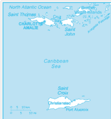
U.S. Virgian Islands.

Strewn like three bright, emerald colored jewels in the Caribbean Sea, the three U.S. Virgin Islands of St. John, St. Croix and St. Thomas provide a variety of activities for the tourists who stream off the cruise ships daily. Watersports, shopping for duty-free items, or just lounging around on the beautiful beaches are all possibilities.