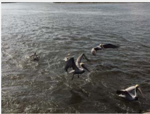
Pelicans following the boat.

After a few minutes, he brought the net back onboard. The birds in the area were pros at this and knew exactly what would happen next. They hung out on the boat, followed behind in the water, and flew around, all waiting patiently for the tidbits that might fall out of that net.