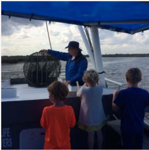
Showing the net to the kids.

After a few minutes, he brought the net back onboard. The birds in the area were pros at this and knew exactly what would happen next. They hung out on the boat, followed behind in the water, and flew around, all waiting patiently for the tidbits that might fall out of that net.