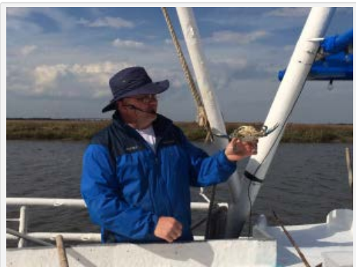
Showing a blue crab before it attacked.

He had a mishap with one of the local blue crabs which was astonishingly hostile and leaped, quite literally, 12 inches in the air to latch onto one of his fingers. He was amazingly calm as the damn thing drew blood, merely asking for help from a crew member to get it detached. He went on talking with a paper towel wrapped around his finger to staunch the blood. Remind me to give crabs a wide berth on the beach!