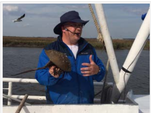
Showing a horseshoe crab.

I didn't realize horseshoe crabs were in the area, but these neanderthal-looking creatures are all around, apparently. Stingrays are also in the water although they are not dangerous, and, of course, the most common and popular creature found in this area is the shrimp. All came up in the net and were shared.