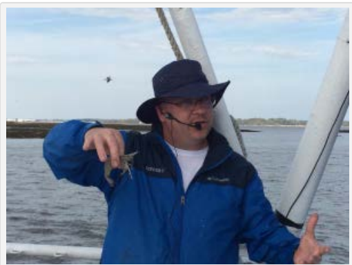
Let's fry him up for dinner!

They actually lowered and raised the net full of interesting creatures a total of three times and each time different creatures appeared. They have even caught small sharks in the net in the past, although we didn't see any on this trip.