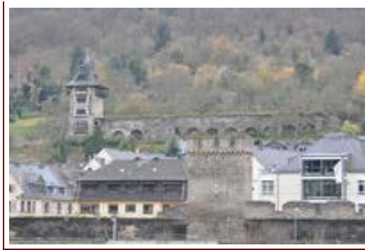
A village with the original old wall around it

We passed almost completely vertical vineyards perched on the sides of the mountains and were amazed that grapes can be picked from that angle.