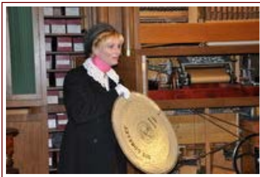
An ORIGINAL CD!

It is well worth a visit and perfect for families.