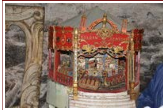
Fabulous antique musical merry-go-round

I'm going to be honest here and say that I wasn't sure how much I would like a museum for music boxes, but it is much more than that and very worthwhile and entertaining. Situated in an old house in Rudesheim, a guided tour takes you through the various rooms, demonstrating all the mechanical music cabinets, boxes, pianos, etc.