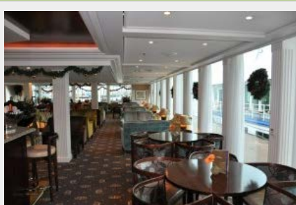
The AmaLegro Lounge

It was dusk in Amsterdam, the early dusk that comes on in the fall in Northern Europe, and the MS AmaLegro was lit up like a Christmas tree. Warm, golden light shone from the welcoming, large picture windows onto the dock. Uniformed AmaWaterways personnel came out to help us with our luggage.