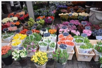
Ashore, we visited a stunning flower market in Amsterdam.

One of the things we were the most worried about – that the ship would be small – ended up being one of the things we loved most about our trip. With a design that fosters comfort and relaxation, the ship became much more like a home than any ocean liner we had ever sailed on. The lounge area became like a living room for all of us onboard and, when we were not ashore, we spent most of our time hanging out there, watching the scenery go by, eating, drinking, and conversing – and actually making friends. The relatively small size of the river cruise ships also means that they can dock right in the middle of the river cities in Europe and you can literally step out onto the main street of a place like Cologne, Germany. No waiting in long lines to get off the ship – just step out and you're there!