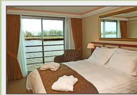
The accommodations were very comfortable aboard the MS AmaLegro.

Tagged as: AmaWaterways , cruises , European vacation , river cruises