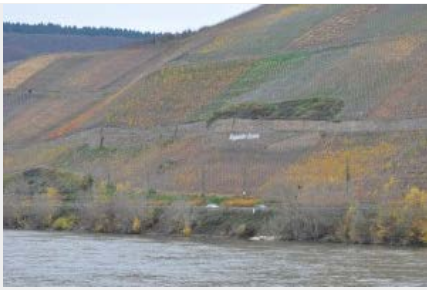
And we slipped by vertical vineyards in Germany.

price of the cruise. AmaWaterways provides you with these great little devices that include headphones and a small box gizmo you tuck in your pocket, which allows you to hear everything the guide is saying. Such a nice change from missing everything if you're in the back of the group. If there are tickets required to get into a museum, etc., you don't have to worry about it.