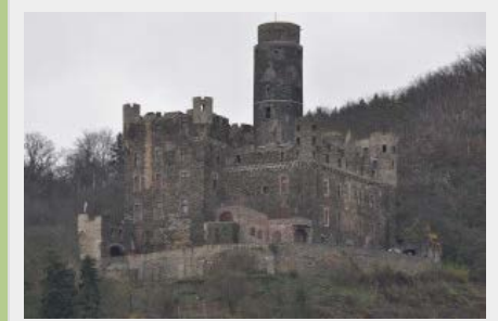
We cruised by a castle in Germany.