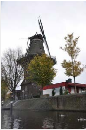
Cruising past a windmill in Amsterdam.