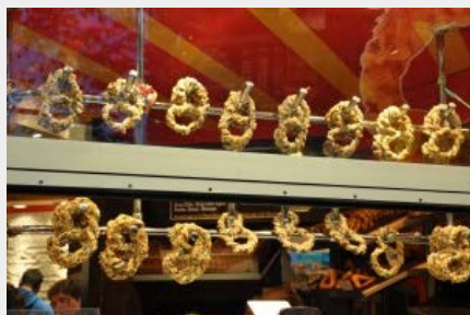
We sampled freshly made pretzels in Cologne.

We have never made friends on an ocean cruise. It's not a situation that's particularly conducive to making friends unless you're extremely outgoing, which we are not. We have had perfectly pleasant table mates at dinner, but none with whom we stayed in contact after the cruise. But we're still Facebook friends with the people we met on our river cruise. We were welcomed to their table at meals, they made an effort to be with us when we went ashore, and they made it very obvious that they enjoyed being with us. This is largely due to the intimate nature of the river cruise and we loved it.