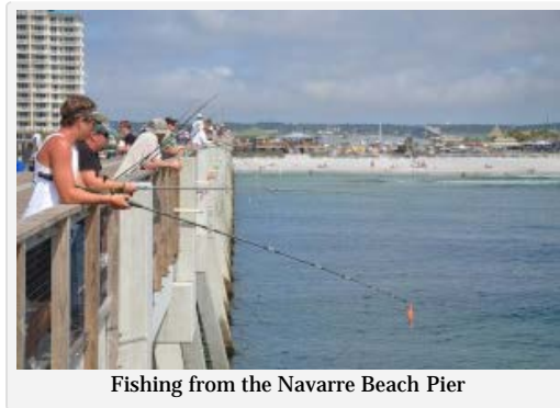
Fishing from the Navarre Beach Pier

Navarre Beach is quiet and may seem isolated when you first arrive, but you can easily drive a few minutes in any of several directions and come to a variety of destinations which your family will love. The Navarre Beach Marine Science Station is located right at the Navarre Beach Park and offers camps and classes for kids to learn more about the marine ecosystem of coastal Florida. When we were there, groups of kids were learning about marine life and kayaking in the gentle bay – and they were having a ball.