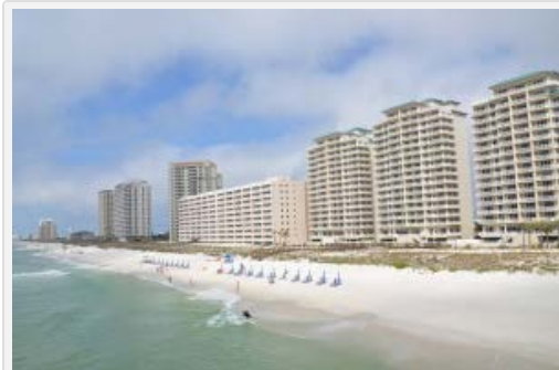
Navarre Beach in front of Summerwind Resort

Before we arrived at lovely Navarre Beach , we stopped at a Publix grocery on the way to pick up drinks and snacks to stock the fridge in our condo. We stopped before we got to Navarre because the last time I was there several years ago, there was no grocery store. You had to drive to nearby Pensacola or Gulf Breeze if you wanted to pick up groceries.