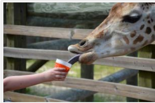
Giraffe having a snack at the Gulf Breeze Zoo.

Just a few miles away, The Gulf Breeze Zoo is one of the most kid-friendly zoos we have ever visited. The Walking Path and Petting Zoo has a large petting area, a giraffe feeding station with the friendliest giraffe I have ever seen and a free-flight budgery full of colorful parakeets.