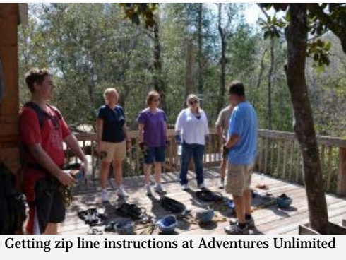
Getting zip line instructions at Adventures Unlimited