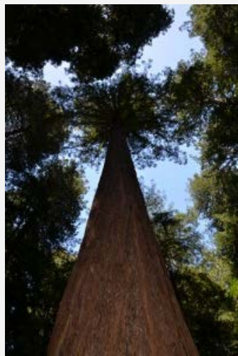
Giant redwood tree soars into the sky.

In the middle of the little town of Lahaina on the island of Maui, there is an ancient banyan tree that is massively huge. It has spreading, winding branches that fill the little park where it's located. It's quite impressive and was the largest tree we had ever seen.