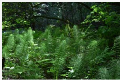
Ferns cover the forest floor.

We would have loved to stay longer, but it was time for our tour to head on to the beautiful island of Sausalito, so we headed back to the parking lot, lingering to take in the smells and sights of lovely Muir Woods. One last glimpse of the towering Redwood giants and the beautiful, quiet forest and it was time to go.