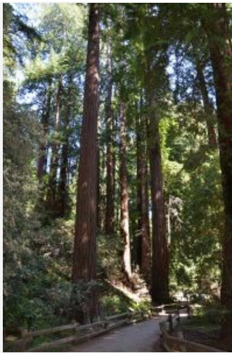
Path through Muir Woods.

The undergrowth is so lush in places, it's hard to see the forest floor. The ferns take over the area, carpeting it in a green sea of waving fronds and bright color amid the lovely streams that make their way through the stillness of the forest.