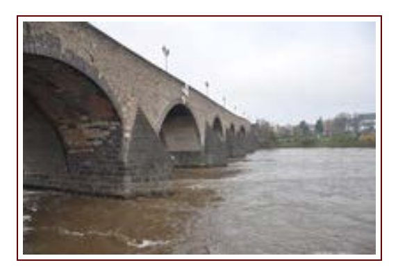
Bridge in the town of Koblenz.

We strolled around the town, taking pictures and just enjoying this scenic German town.