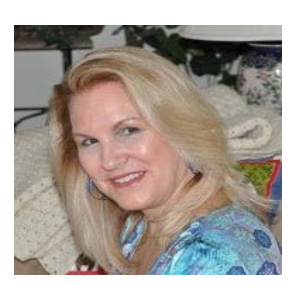
Who is Jan Ross?

We had the opportunity to take a walking tour of Koblenz in the morning, but we opted to sleep in and just take a tour of the town by ourselves, rather than get up early. This is one of the nicest things about this wonderful river cruise - you can make your own schedule. You can participate in the planned activities or make your own way and either