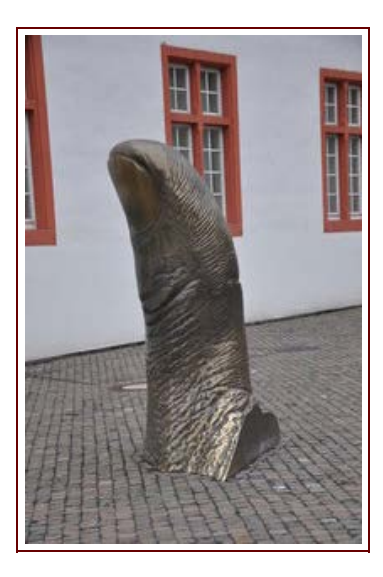
Incongruously modern sculpture in town!