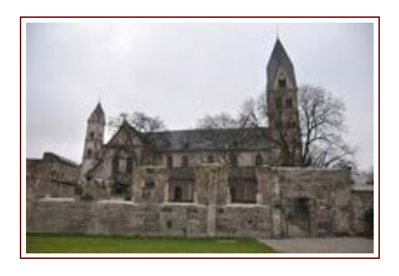
There are gorgeous old churches and cathedrals in every town.