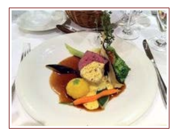
Whole roasted Maredo Beef Fillet with Port Wine Gravy. Served with Carved Vegetables and Potato Gratin.

My husband had the seafood dinner and I had the beef and, let me just tell you, that may have been the best fillet I have ever eaten IN MY LIFE. I could have cut it with a butter knife and it melted in my mouth.