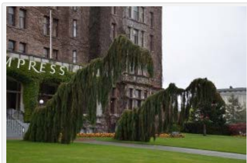
The Empress Hotel in Victoria.

What about you? Are you a fan of the hop on, hop off concept?