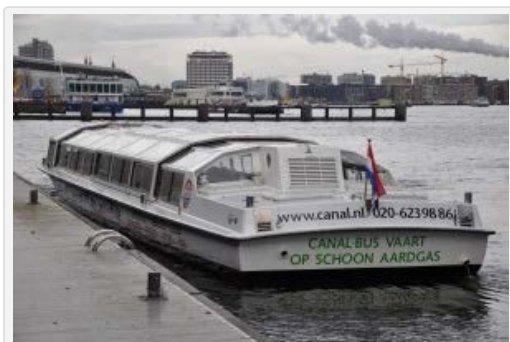
Canal Tour Boat in Amsterdam.