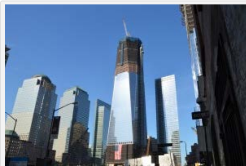
Ground Zero in New York.