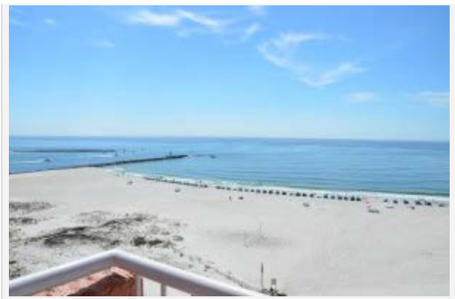
Beach View from a room balcony at the Perdido Beach Resort

Go down each morning to the Cafe Palm Breeze and choose the breakfast buffet or order a freshly-made omelet at the omelet bar. Then have lunch by