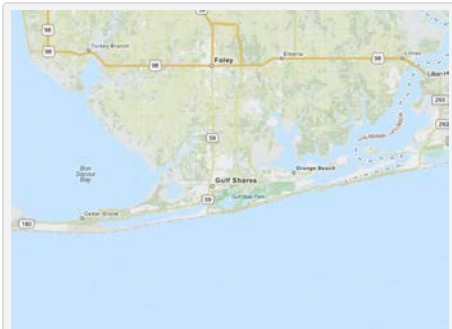
Gulf Shores / Orange Beach (click to see Mapquest)

Now just keep on driving you are totally out of road. You should see the sugar-white sand and crystal green water of the wonderful gulf coast area.