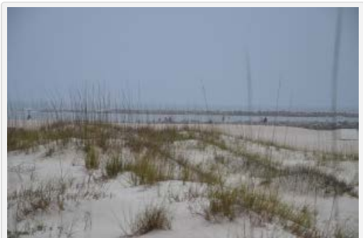
Sea oats and white sand at Gulf Shores

When you are ready for something besides lounging on the beach and scarfing down some great food, you will have plenty of choices in the area. The Alabama Gulf Coast Zoo is nearby and they offer a great kids Zoo Camp in the summer. Leave your car parked and take the convenient Gulf Beach Express trolley to get around the beach area. Kids will love the Gulf Coast Exploreum Science Center which is featuring an exhibit about the largest shark that ever lived – the Megalodon .