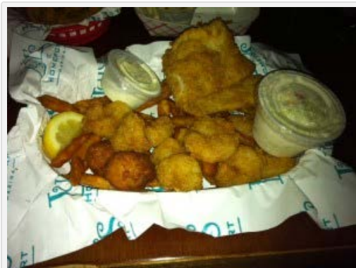
Fried fish and shrimp basket at Lulu's

there's plenty to share – and a fried fish and shrimp basket for dinner. Delicious!