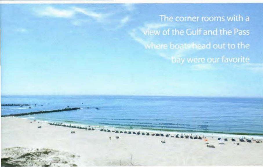
The corner rooms with a view of the Gulf and the Pass where boats head out to the bay were our favorite

Try the onion rings for an appetizer – make sure you share because it's a huge portion – and a fried fish and shrimp basket for dinner.