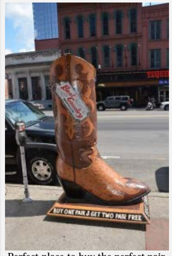
Perfect place to buy the perfect pair of boots!

If you are more interested in the history of country music in the area, visit the Ryman