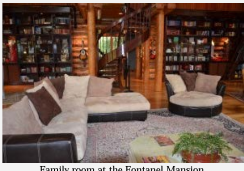
Family room at the Fontanel Mansion.

Music, great food, incredible sights, Nashville truly has it all! What about you - ever been to Nashville?