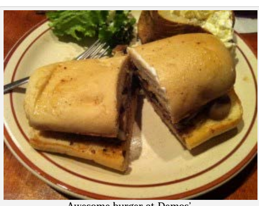
Awesome burger at Demos'.

permanent fixture. It's all absolutely amazing – the 42-foot statue of Athena is especially inspiring. We visited all these locations and others by getting tickets for the Music City Trolley Hop, a 24-hour hop on/hop off trolley that visits all the scenic attractions and comes by about every half hour. It's the perfect way to see the city.