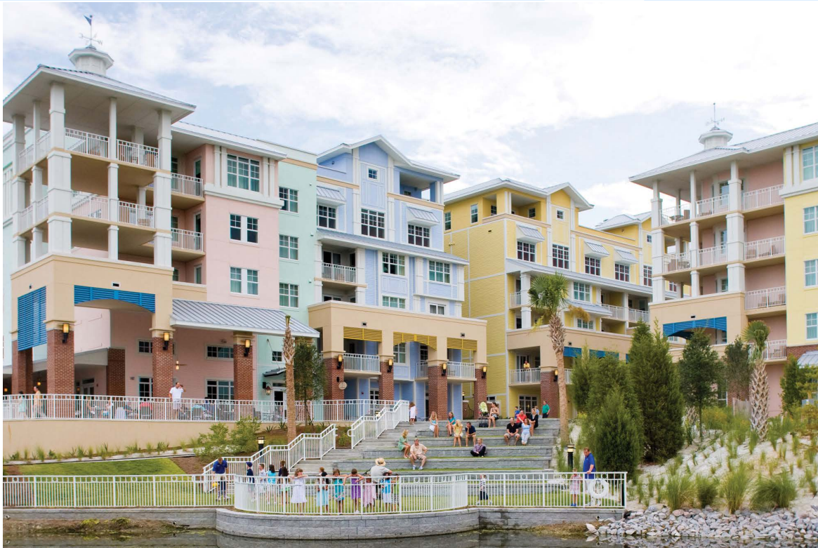
Wild Dunes Resort

Lovely Isle of Palms is a quiet, undiscovered paradise and Wild Dunes Resort is the perfect place to enjoy it. Hotel rooms, condos, and rental homes are all available and the resort comes complete with plenty of pools, kayaking and other water sports, fishing, tennis, bike rentals, a kids camp, and, of course, the beautiful beaches on the island. There are plenty of restaurants available but pop in Hudson's Market for deli sandwiches, chips, cookies, drinks, and have a picnic right on the beach!