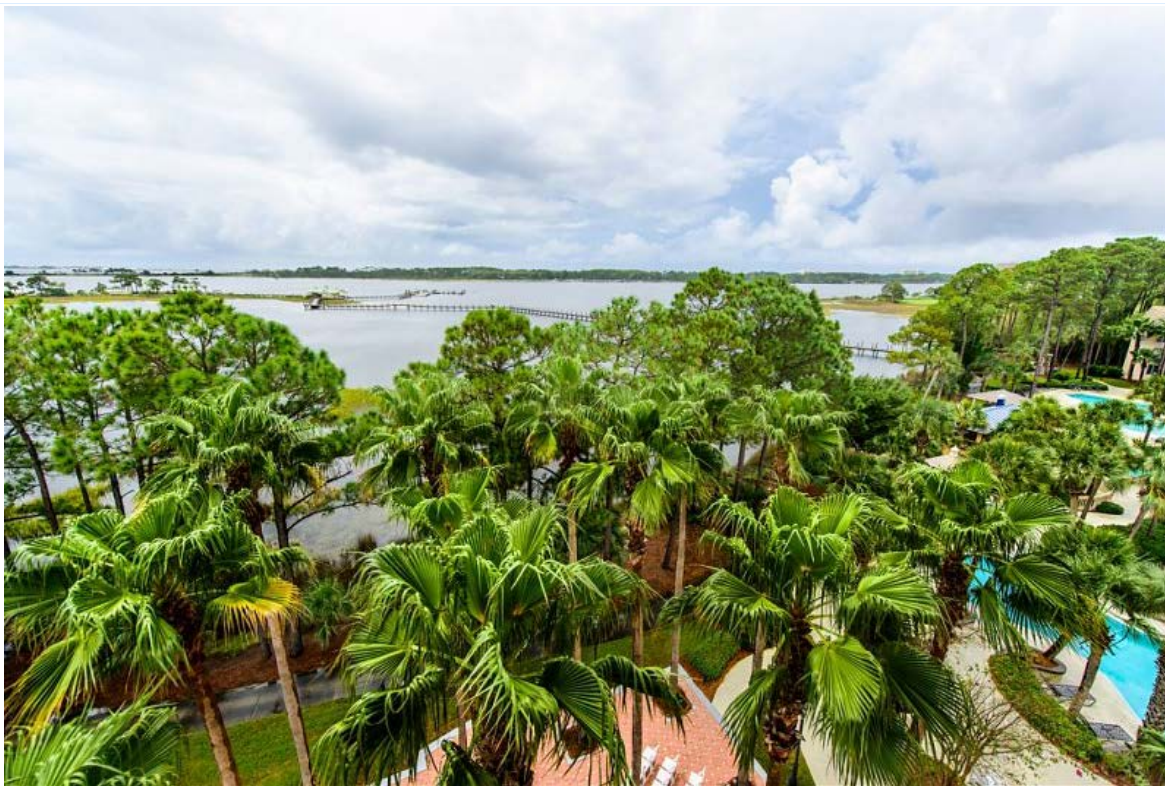
Bay Point Wyndham Resort

This wonderful and undiscovered location is not on the crowded beach in Panama City Beach, but situated beside the beautiful and calm St. Andrews Bay in a 1,100-acre wildlife preserve. The Bay Point Wyndham Resort has lovely hotel rooms but families will enjoy the golf villas, which have one or two bedrooms, a living room, and a small kitchenette. With five pools, tennis courts, plenty of water sports including Jet Ski rentals, and a shuttle to local, unspoiled Shell Island to collect shells and enjoy the beach, there is plenty to do.