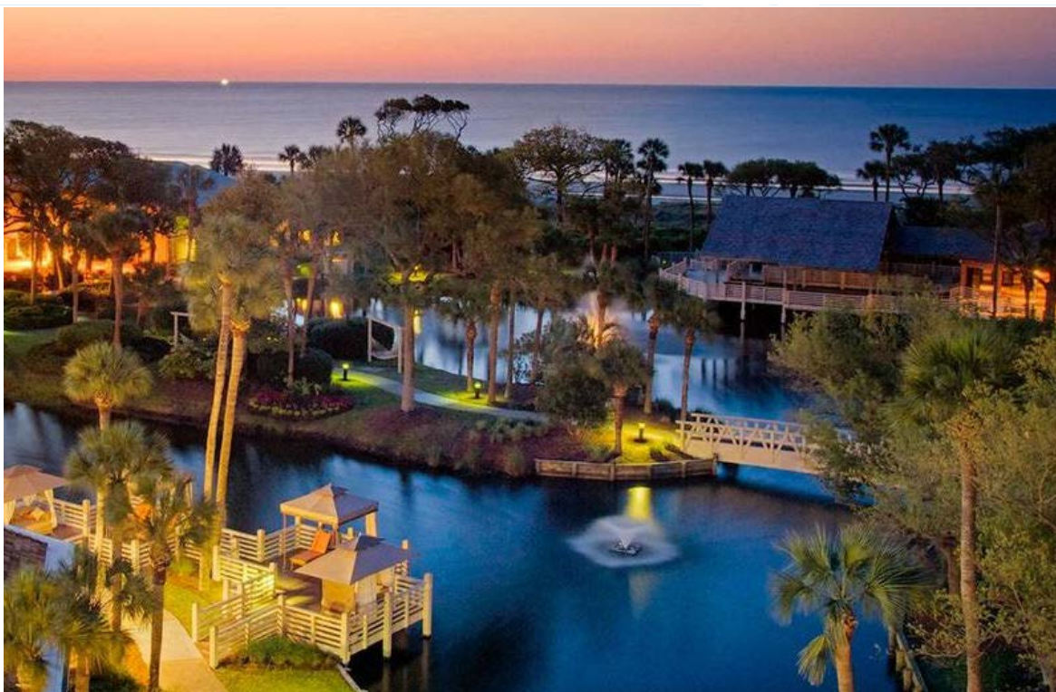
Sonesta Resort

Located on 11 acres of lush foliage and blooming flowers, Sonesta Resort is just steps away from the Atlantic Ocean. A zero entry lagoon-style pool and a kids pool make this a young swimmer's paradise; and there is easy access to tennis, bike rentals, and water sports in the area. The one-bedroom suite with a separate living room, dining area, and kitchenette is a perfect choice for a family. Several restaurants are available in the resort and families should definitely partake of the amazing breakfast buffet at Heyward's.