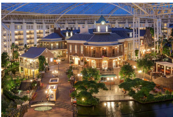
Gaylord Opryland Resort & Convention Center

Resorts are the perfect family destination because they offer a wide variety of activities for every member of the family without ever having to load up the car and drive somewhere else. Many come complete with restaurants, pools, plenty of on-site activities and even complete kids camps; and most are located in beautiful, idyllic destinations as well. When you are planning your next family vacation in the southern Un