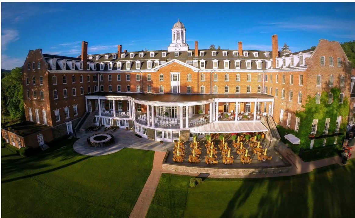
Otesaga Resort Hotel

Nestled in a gorgeous location, the kid-friendly Otesaga Resort Hotel 📍 overlooking beautiful Otesaga Lake is a great family vacation destination complete with an outdoor pool, canoeing, boat rentals, paddle boarding, biking, fishing and golfing. There are plenty of accommodation choices, but arrange a stay in one of the lake suites for the best view. With the complete spa and several dining options, everyone in the family will enjoy their stay here.