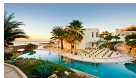
Travel Like the Stars: 5 Family-Friendly Resorts That Celebrities Love