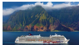
Late Summer and Fall Cruise Deals for Families