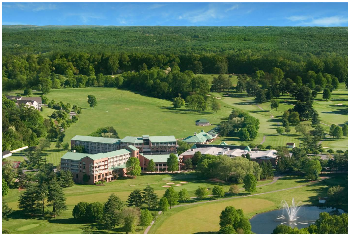
Turf Valley Resort

The beautiful and historic Turf Valley Resort located in charming Ellicott City has plenty to offer your family with golf, tennis, volleyball, basketball, indoor and outdoor pools, and a hiking nature trail. The rooms and suites are lovely but the two and three bedroom villas are fantastic for families. The spa offers several treatment options and the on-site restaurant, Alexandra's, offers delicious American fusion options along with scenic outdoor dining overlooking beautiful views of the resort.