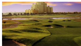
America's 10 Best Family-Friendly Resorts