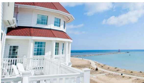
Blue Harbor Resort

Staying at a resort in the North this fall is the perfect family vacation destination choice, especially for families who are looking to get entertained without ever leaving the property. Even when the weather gets a little chilly, there are plenty of outdoor activities like hiking, biking, and water sports available to warm you up, in addition to indoor pools and water parks. When you are planning your next kid-friendly vacation in the