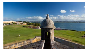
10 Warm Destinations to Spend Christmas with the Family