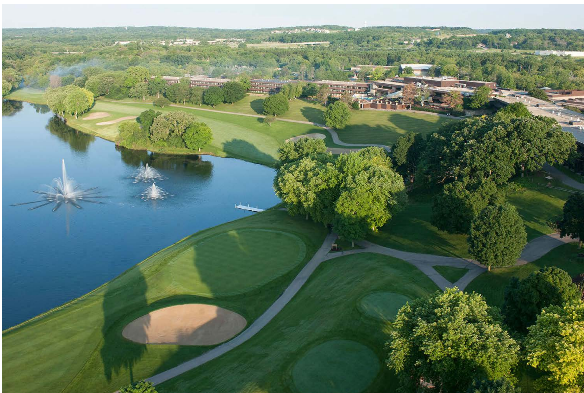
Grand Geneva Resort and Spa

A complete Adventure Center which offers mountain biking, hiking, disc golf, volleyball and archery make the Grand Geneva Resort & Spa located in beautiful Lake Geneva a great family vacation place. But add in the 50,000-square-foot Moose Mountain Falls Water Park and your kids will never want to leave. The fitness center offers other great amenities for kids like cycling, yoga, an