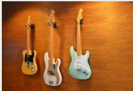
Guitars on display in the Hotel Valley Ho lobby