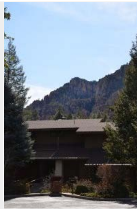
A Creekhouse at the Junipine Resort