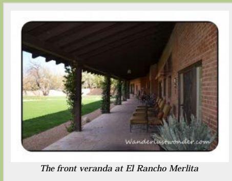
The front veranda at El Rancho Merlita