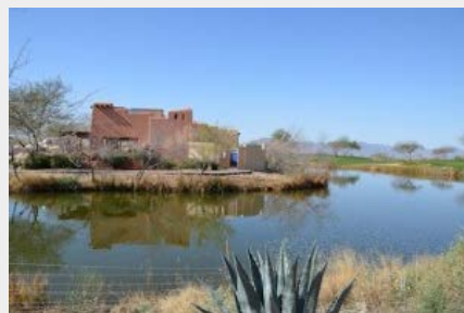
Aji Spa at the Wild Horse Pass Resort

We had no idea that when we turned off the Interstate that we would drive two miles through the resort property, which consists of gorgeous desert landscaping, before we even reached the resort itself! The resort was designed to be an authentic representation of the Gila River Indian Community's heritage and culture and the stunning architecture is a good example of the way they have stayed true to this vision. Visit the "Aji Spa" for one of their signature treatments, have dinner at the incomparable "Kai" restaurant, take a hike on one of the many trails that wind through the desert, or enjoy a sunrise horseback ride. They are offering some great specials this summer but one of my favorites is the Sunsational Savings in which you get a fourth night free, a food and beverage credit of $100, and an upgrade on check-in, if available. Check out the deals on their website.