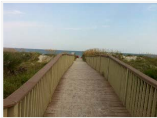
It's not too late to head to the beach!

The official first day of fall has come and gone, the weather is slowly getting cooler and the days shorter so beach vacations may seem like a thing of the past at this point but, in reality, this is absolutely the best time of the year to visit many beaches. After Labor Day, the crowds diminish as children head back to school, and the prices are lowered, but the weather in many of these areas is still warm enough to enjoy the beach, have a swim, have some great seafood, shop and visit the local spa.