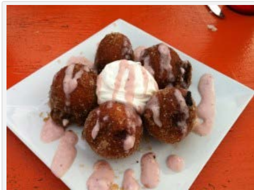
Fried Strawberries at Coco's Sunset Grill, Tybee Island

seafood restaurants. We have stayed in a darling, hot pink cottage steps from the beach we rented from Mermaid Cottages and a sprawling, luxurious, huge beach house just a few blocks away from the beach that we rented from Tybee Joy Vacations . Both rental agencies have a wide variety of cottages and houses available. Be sure to have dinner one night at Coco's Sunset Grille and order the fried strawberries for dessert – they are unique and incomparable! Savannah is only a 15-20 minute drive away so spend a day taking a Segway tour , shopping on River Street, walking through the gorgeous neighborhoods of mansions and parks then have dinner at The Pirates House where sailors were shanghaied years ago to serve on sailing ships.