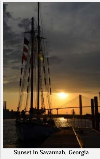
Sunset in Savannah, Georgia

3. Isle of Palms, South Carolina. Technically considered part of Charleston, Isle of Palms is actually just a short drive from the city and the perfect location to enjoy a beautiful beach but also have access to the city. Plan to stay a few days at the Wild Dunes Resort because you will not want to leave! The resort offers hotel rooms, condos and beach houses of all sizes for your stay. With several pools, a golf course, tennis courts, biking, and just relaxing on the beautiful beaches, there is plenty for everyone to do here. Pay a visit to the Sand and Sea Salon for relaxing massage and stop in the gift shop in their lobby for some cute jewelry and clothes purchases. There are several restaurants on the property as well as a poolside grill and a market where you can buy fresh sandwiches and other items for a beach picnic. Stop by the Sand Bar located in the Links Clubhouse for a great breakfast or a lunch filled with Southern specialties like shrimp and grits.