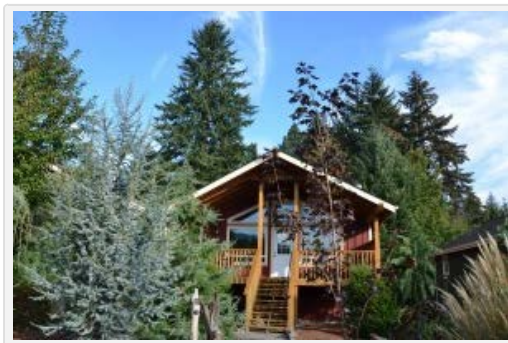
Mt. Adams cabin at the Carson Ridge Luxury Cabins.

2. Carson Ridge Luxury Cabins in Carson, Washington: You might not think of a cabin when you consider a Bed and Breakfast location, but you absolutely should, and your first consideration should be to stay at the Carson Ridge Luxury Cabins. All of the cabins are beautifully furnished, but I can personally recommend the Mt. Adams cabin. Located in the stunningly gorgeous Columbia River Gorge only 45 miles east of Portland, Oregon and Vancouver, Washington, the cabin is close to a number of engaging activities such as hiking trails, waterfalls, wine tastings, fishing, and whitewater rafting. Carson Ridge Luxury Cabins is truly in an idyllic location. Pete Steadman and his wife Latisha own the Carson Ridge Luxury Cabins and have lovingly designed the scenic landscaping and the excellent furnishings in every cabin. A front porch with a porch swing welcomes you to Mt. Adams and provides an amazing view of the surrounding mountains. A king size bed, a huge Jacuzzi tub, and sitting area complete with a warm fireplace make this cabin your home away from home. Relax in the soft, fluffy robes that are given to you, then enjoy a hot gourmet breakfast basket that is delivered right to your door!