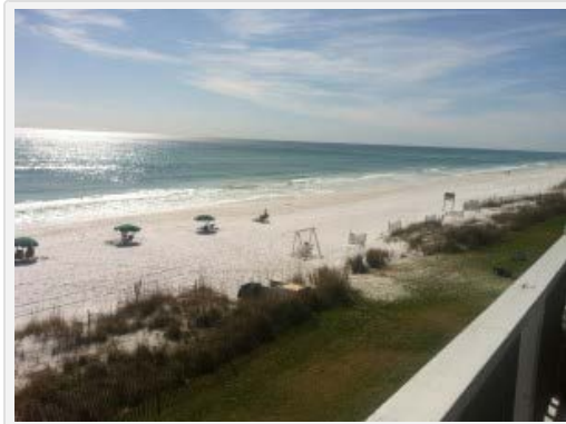
View from the Henderson Park Inn.