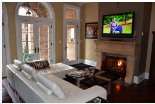
Relax before breakfast at the Villa D'Citta.

and shops. Don't worry about finding a meal unless you really want to because not only is a full, hot and delicious breakfast served every morning, but the kitchen is kept stocked for guests and you are free to help yourself. The fridge is full of