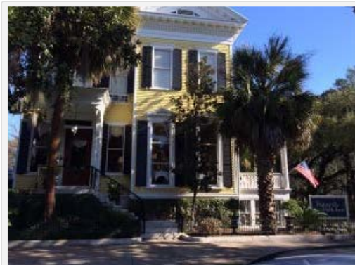
Forsyth Park Inn in Savannah.

Be sure to make a reservation for dinner at The Beachwalk Cafe . Located in the dining room with huge windows that overlook the incredible ocean view, the food here is just unbelievably good.