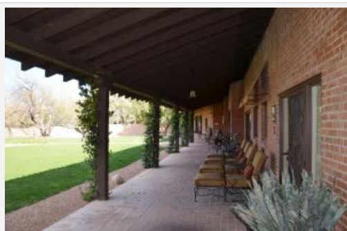
Shady porch at the Inns at El Rancho Merlita.

3. The Inns at El Rancho Merlita in Tucson, Arizona: The Inns at El Rancho Merlita in Tucson are tucked neatly away in a neighborhood on the outskirts of the city. Once you drive up the driveway that wends past the desert and through the lovely gates, peace and quiet envelops you. Pretty soon, you find that the history of this gem bed and breakfast location is just as fascinating as the surrounding serenity.