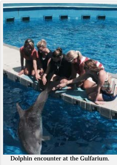
Dolphin encounter at the Gulfarium.

Uncle Buck's Fishbowl and Grill is located in a wonderful shopping center called Destin Commons . Rather unprepossessing from the road, this shopping center is a truly an undiscovered gem. Pedestrian friendly with lovely fountains and landscaping, there's a large kids play area in the center and a splash fountain that welcomes kids to romp and play. Unique stores dot the center, from a Tervis store with every Tervis cup you can imagine to small, charming local clothing and jewelry shops to Belk, their anchor store, and you can easily spend a day here and leave with an armful of packages, as I did.