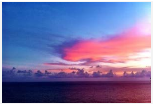
Sunset at the Emerald Coast.

kids. Now, make that reservation and let your kids play in the "snow"!