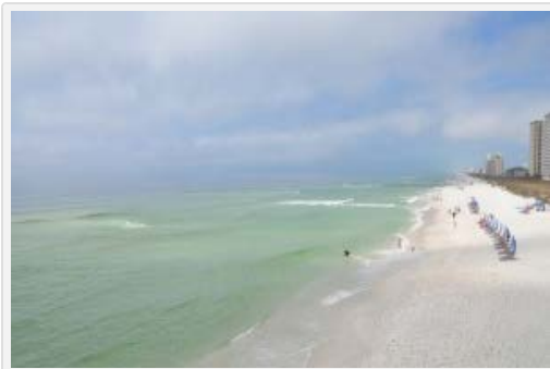
View of the beach.

If your family is lucky enough to be one of those which has kids starting school after Labor Day, you still have time to plan a trip to the gorgeous Emerald Coast of Florida . And you should immediately do so. The pure sugar white sand and amazing Gulf of Mexico simply can't be missed. If your kids also have a fall break, plan your getaway for then as the area is still warm and beautiful and the prices will be even lower.