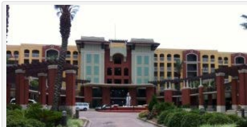
The Azure Resort.

One of the best things about the Azure Resort is its close proximity to plenty of family friendly activities, shopping, and great restaurants in the area. Check in, enjoy the beach, and try one (or all) of these suggested itineraries.