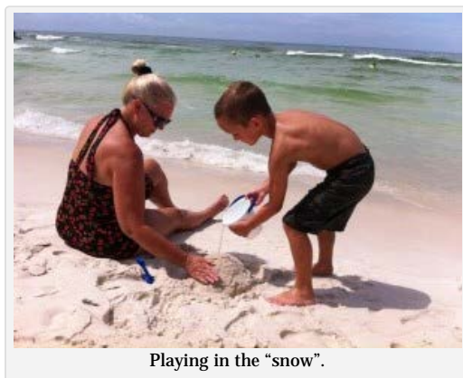
Playing in the "snow".

first, but the Coach store will sometimes have special coupons for up to 50% off that day. You can even use that coupon for their clearance area in the back so be sure to stop by. Stuff your car with those shopping bags, pick up your family, and make up for deserting them all day by taking them to dinner at Mama Clemenza's in Fort Walton on your way back to the Azure Resort. The family will love their pasta and pizzas, all homemade with love by this family owned and run restaurant. Tucked away in a shopping center, it may not seem like the best place to have Italian food, but I assure you it absolutely is. Get some cannoli to take home because you are going to be full to eat it right after dinner!