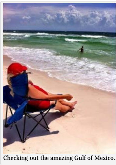
Checking out the amazing Gulf of Mexico.

After your completely relaxing spa experience, rejoin the family for a cruise onboard the Southern Star , docked right at Harborwalk Village. This 80 foot glass bottom boat provides an unforgettable dolphin and sunset watching cruise that lasts for two hours and will give you opportunities for some gorgeous photos. The captain even allows kids up to the wheel house to steer the boat for a short time! After your cruise, stop in Jackacuda for dinner and try their amazing fresh seafood and sushi.