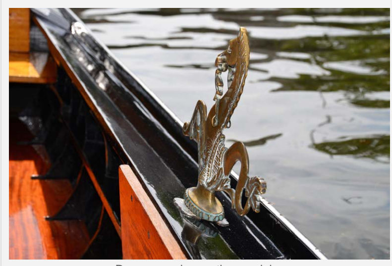
Dragon carving on the gondola.

than one piece! The gondola has beautiful, hand-sculpted ornaments and steel trim, giving it silver accents. The bow and stern are carved with mythological deities and sea creatures, and it also bears two plates with a Venetian expression: "Cocai in laguna, burasca in mar; dove no se crede, l'aqua rompe," (translation: safety in the lagoon, stormy in the sea; where one does not believe, the water breaks [him.])