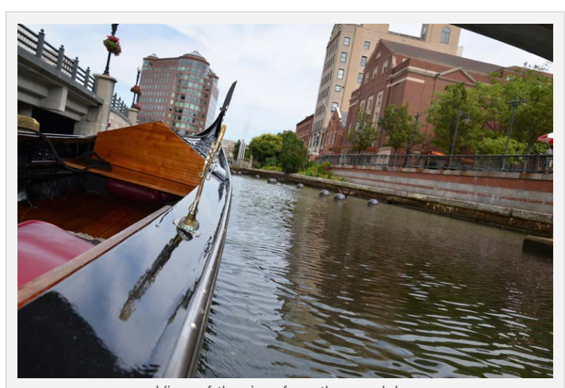
View of the river from the gondola.

We slipped past the walk along the river, office buildings and restaurants, and people strolling along the river. We passed under several bridges and one of the first had big piles of firewood under it. We couldn't imagine what it was for until Marcello told us about WaterFire, an art installation created by artist Barnaby Evans which consists of dozens of braziers that are floating in the middle of Providence's three rivers which are filled with wood and lit on fire. The fires are lit around dusk, and the braziers are fed by a small army of volunteers and staff over the course of the evening, utilizing the piles of firewood we saw under the bridges. Music plays, people stroll the river walk, and the entire experience must be wonderful.