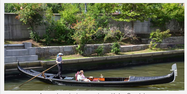
A couple enjoying a cruise with La Gondola.