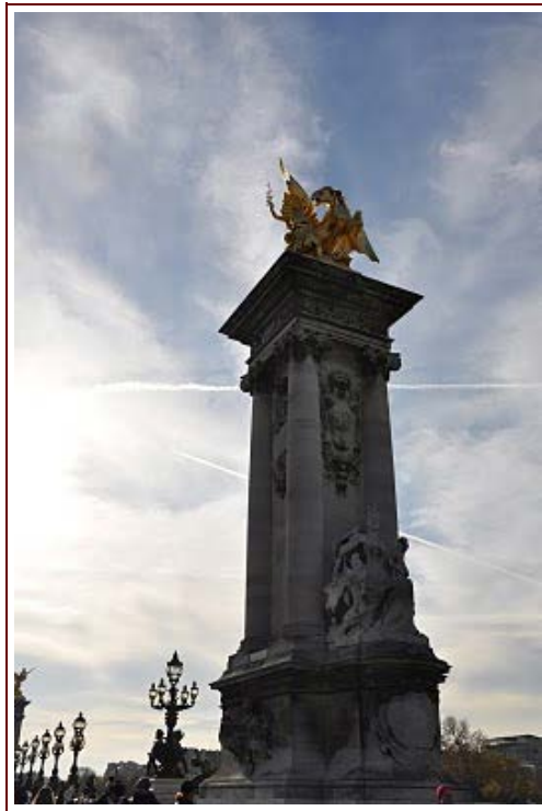
Pont de Alexandre III.

From there, we just wandered along the Seine, keeping the Eiffel Tower in our view until we realized that finding a restroom was a priority. By this time, we had left the cafes behind and there seemed to be no restrooms in sight. Luckily, we stumbled upon the American Church in Paris where they not only kindly let us use their restrooms, but were also having probably the most charming little Christmas market I have ever seen. They had beautiful, handmade items, lovely baked goods and a whole room full of books. We managed to add a few things to our European purchases collection and then headed on to the Eiffel Tower.