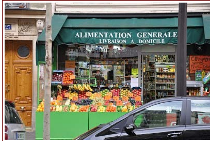
We saw these little neighborhood markets all over Europe.

tasting river cruise but, seriously? Who could pass up visiting Paris? Not us. They also offered a bus tour of Paris the first day as part of the package. We decided that we would get up when we woke up and, if that happened to coincide with the bus tour, we would hop aboard and, if not, we would make our own way. We made it downstairs by 9:00, just as everyone was bundling up to leave. Our wonderful tour guide, Sue, who had accompanied us to Paris, encourage us to grab a bite to eat, throw on our coats and join them. But we decided to have a more leisurely breakfast and make our own way.