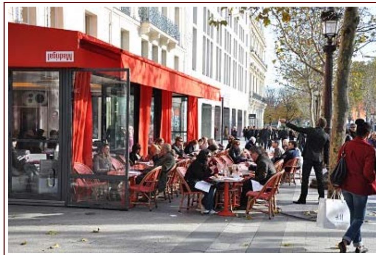
Sidewalk cafe - you know you are in Paris now!

Next, we decided to walk to the Eiffel Tower . We could SEE it, so how far away could it be really? Yeah. Pretty far. Luckily, we are both in pretty good shape and made it in surprisingly good health, considering it was about a mile from the Arc de Triomphe. Adding on the mile or we walked from the hotel, we did a lot of walking! But it was walking through Paris, so how can you complain!