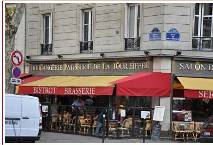
Sidewalk cafe one block from the Eiffel Tower.

We were meeting some friends we had made on the MS Amalegro for dinner at a cafe by their little hotel near the Eiffel Tower, so we killed a little time by having some drinks at a darling little cafe where we could actually SEE the Eiffel Tower as we had our orange presse, a tart and lovely drink I had for the first time here. It's time like this, sitting in a sidewalk cafe in Paris looking at the Eiffel Tower, that I find it hard to believe I am actually having this experience. But I was. And it was wonderful.