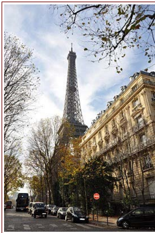
View from our little sidewalk cafe.

From there, we just wandered along the Seine, keeping the Eiffel Tower in our view until we realized that finding a restroom was a priority. By this time, we had left the cafes behind and there seemed to be no restrooms in sight. Luckily, we stumbled upon the American Church in Paris where they not only kindly let us use their restrooms, but were also having probably the most charming little Christmas market I have ever seen. They had beautiful, handmade items, lovely baked goods and a whole room full of books. We managed to add a few things to our European purchases collection and then headed on to the Eiffel Tower.