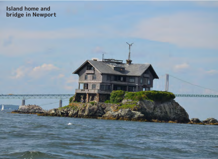
Island home and bridge in Newport

The upper deck includes a shaded area and lots of tables and chairs, along with loungers for relaxing in