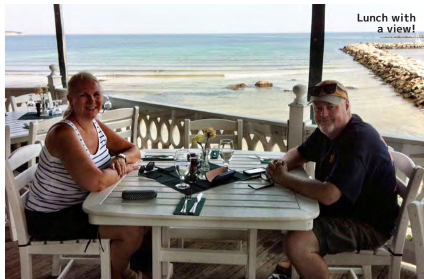
Lunch with a view!