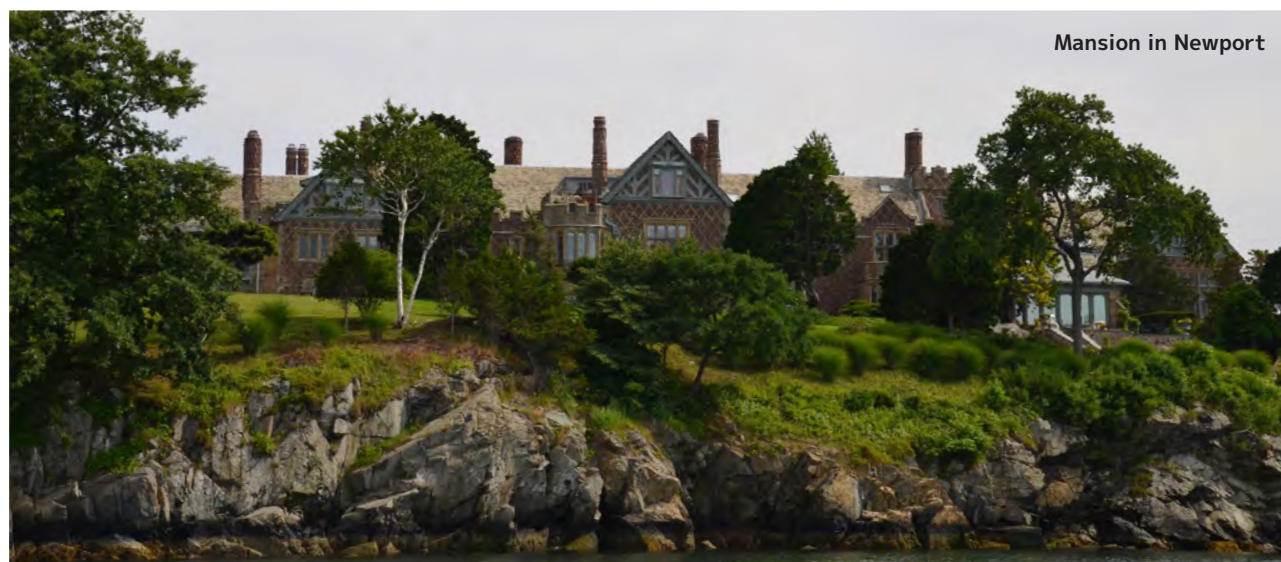
Mansion in Newport

Heading back in the direction of Rhode Island the next day, we stopped on Block Island -- which was a shock! Expecting a quiet island