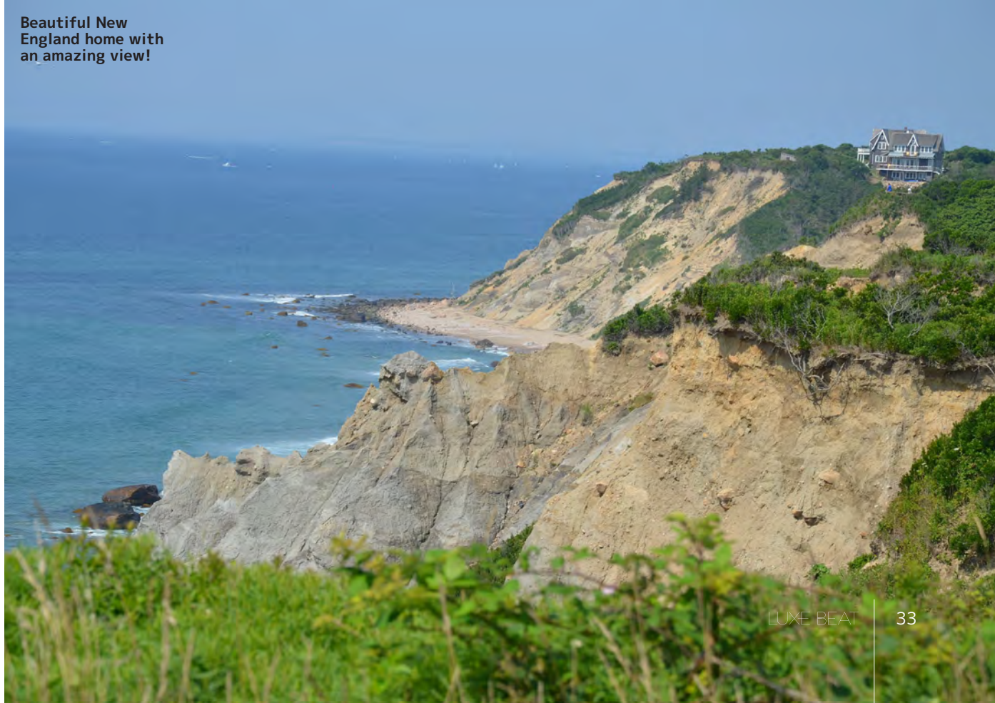
Beautiful New England home with an amazing view!