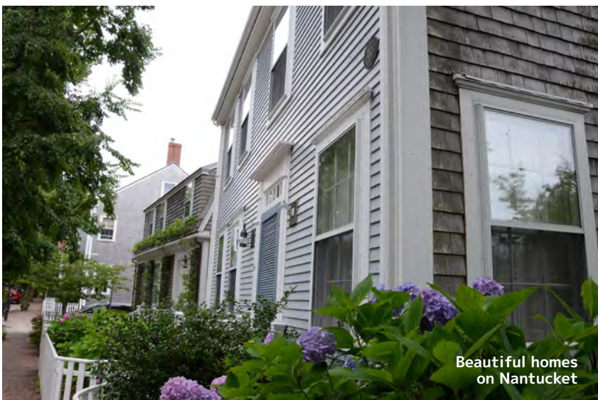
Beautiful homes on Nantucket

The cruise embarks from tiny Warren, Rhode Island, where Blount Small Ship Adventures is based. It's convenient to park for free in their parking lot, hand over your luggage, and walk aboard with no fuss. After