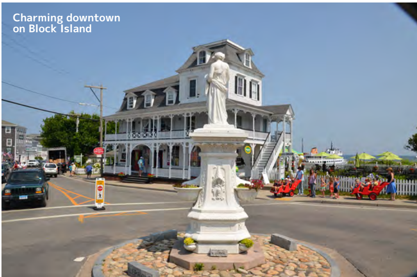
Charming downtown on Block Island