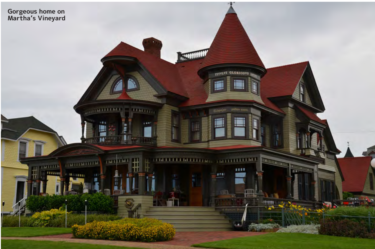
Gorgeous home on Martha's Vineyard

unpacking and finding a place for everything in our small stateroom (this is made easier by the fact that you can stow all your luggage under the beds) and a delightful lunch of fresh lobster salad, we headed to the top deck to watch our ship begin the short journey to Cuttyhunk, the outermost of the Elizabeth Islands in Massachusetts, where we would drop anchor for the night. The beginning of our voyage set the tone for the rest of the trip, with friendly fellow passengers, gorgeous weather, and calm water. Quiet Cuttyhunk was mainly a place to spend a night sleeping blissfully but a few of us did disembark and stroll the quiet island paths in the dusky evening.