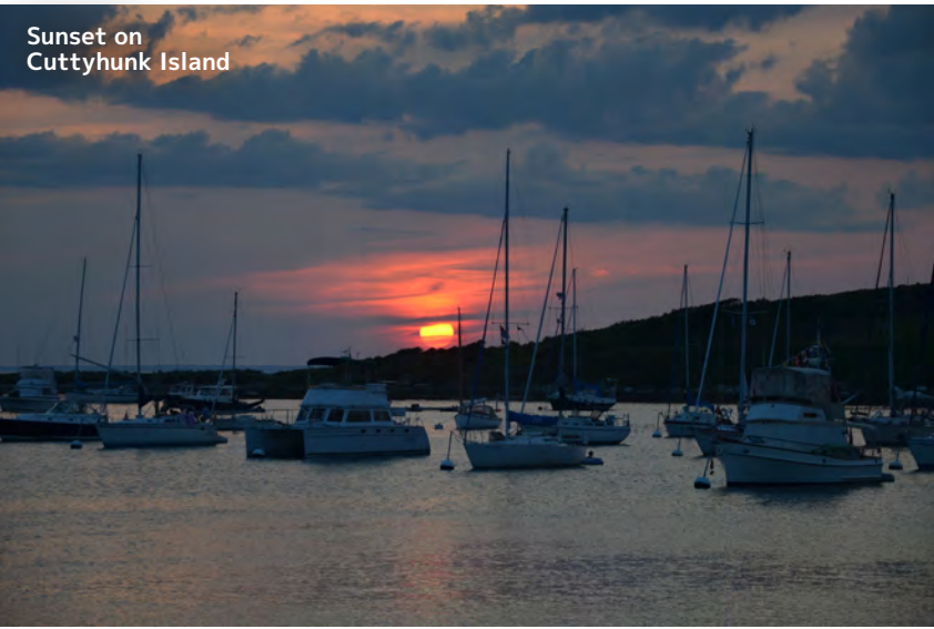
Sunset on Cuttyhunk Island