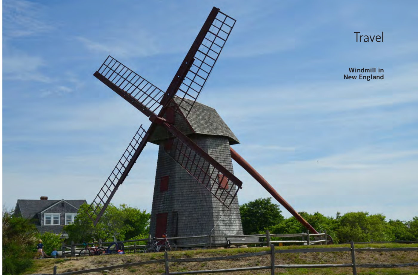
Windmill in New England

reasonable fare and headed back to Oak Bluffs for a stroll along the coastline and, once again, to marvel at the astonishingly beautiful Victorian mansions in the area. A large and very popular park lies in the middle of town, surrounded by truly amazing mansions, all of which are single family dwellings and many of which are only used in the summer. Families were relaxing in the park, many with picnics and several with kites which caught the strong wind from the ocean.