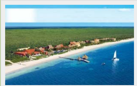
Zoetry Paraiso de la Bonita all-inclusive resort