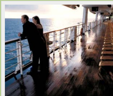
Overlooking the high seas at sunset...

When we stayed at the Paradisus Punta Cana , we had to ride trams all over the place because it covered miles and miles of land. There's usually plenty of room to stroll around on a cruise ship but, at some point, you reach that deck railing and the stroll is over. All-inclusive resorts definitely win this one as they have room to spare.