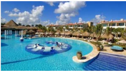
Paradisus Punta Cana resort

always free, non-motorized watersports. For example, snorkeling is usually free and the resort provides you with all the equipment you need. At the Punta Cana Princess , for example, you can just pick up your snorkeling equipment and snorkel right off the beach.