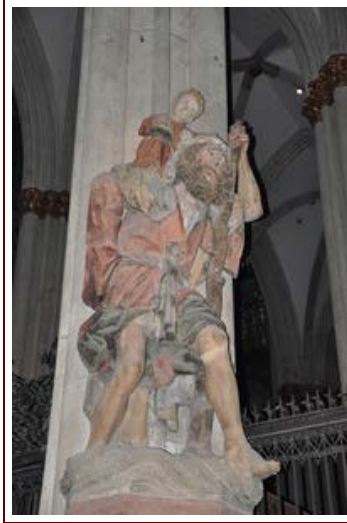
Saint Christopher statue