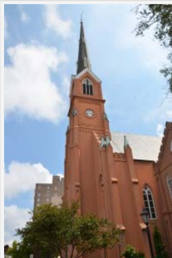
One of the many churches in Charleston.

We didn't expect to love Charleston as much as we did. We had already fallen deeply in love with Savannah, Georgia and casually thought that Charleston would be very similar in many ways. It is a little similar in that it's another quiet, friendly, lovely Southern city with a water view and gorgeous, historic homes but Charleston has its own distinctive character.