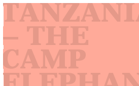
Tanzania – The Camp Elephant