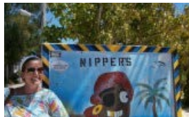
OLYMPUS DIGITAL CAMERA