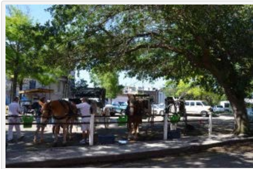
Lots of carriage tours.

For some time on the water, plan a trip out to historic Fort Sumter with SpiritLine Cruises . They provide the only cruises to Fort Sumter and the boats are clean and comfortable with restrooms and a snack bar. You can leave from Liberty Square in downtown Charleston, or in Mt. Pleasant at the Patriots Point Maritime Museum, the world's largest naval and maritime museum. I recommend leaving from Mt. Pleasant, which is an easy walk from the City Market. Just don't try to walk