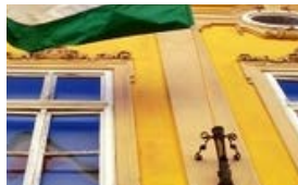
The Magic of Hungary: Budapest and Beyond