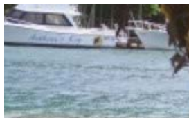
Roatán – Ultra-Relaxed to High Energy in Honduras's Bay Islands

Tags: , Charleston City Market, Charleston South Carolina, Circa 1888, Fort Sumter, King Charles Inn, Palmetto Carriage Tours, South Carolina, Spiritline Cruises