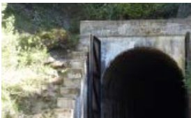
Route of the Hiawatha