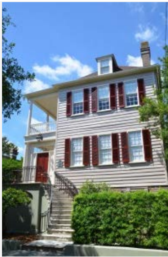
Beautiful Charleston home with a piazza.

really a lot of fun to see the town in a carriage pulled by mules! The guides know all about Charleston and you will learn all about The Holy City and its history as you view the many magnificent churches (source of the city's nickname) and truly gorgeous homes. It's a perfect introduction to the city.