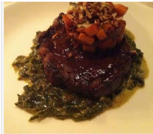
Wonderful steak at Circa 1888.

Recommend 5 people recommend this. Sign Up to see what your friends recommend.