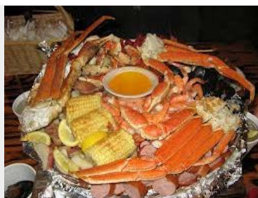
The Low Country Boil

But when you're ready for a great seafood dinner, head to Schooners right on the beach in Panama City and sit on the deck to watch the sunset. First, order the Thai Shrimp Wraps, which come with some delicious, sweet dipping sauce. After you've polished that off, get the grilled grouper sandwich and prepare to be amazed.