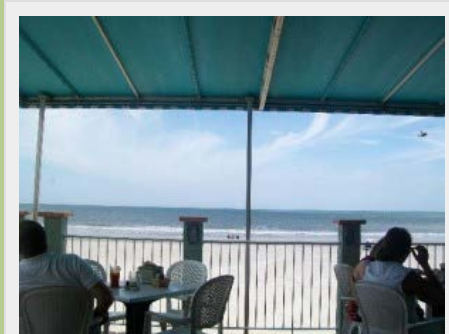
The oceanfront view from Sandy Bottoms Beach Bar & Grill.