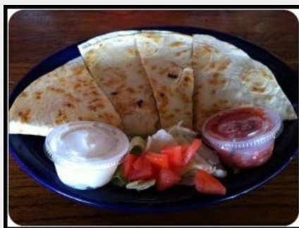
Grilled Shrimp Quesadilla