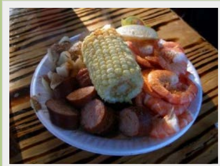
The Crab Shack's sweet corn tops a plate of grilled shrimp, sausage and potatoes.

When you visit Tybee Island, Georgia, stay at one of the Mermaid Cottages and visit the Lighthouse, but be sure to add a visit or two to the Crab Shack. The first time I went, I made the mistake of ordering a sandwich instead of the Low Country Boil for which they are justifiably famous. I never made that mistake again. Get the shrimp, sausage, and corn boil, but don't order the plain boiled new potatoes. Get the "Smashed Taters," which are much better. If you have a good size