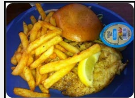
The grilled grouper sandwich.

When you're in this area, stay at the Sandestin Golf and Beach Resort , shop at the fabulous Silver Sands