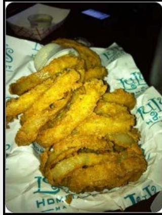
Lulu's famous Onion Rings

What about you? Have you enjoyed a wonderful seafood dinner lately? Where and when? Perhaps in New England? On the West Coast? Tell us about it (and make our mouths water!) in the Comments section.