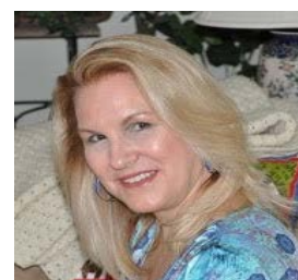
Who is Jan Ross?

We were split into three groups with different colored QuietVox boxes