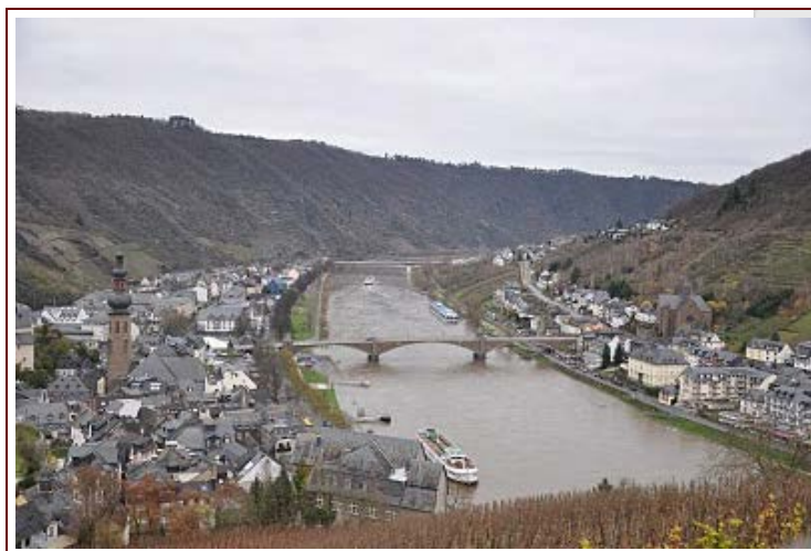
View of Cochem