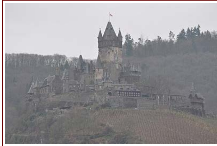
High on the mountain in Cochem

We have actually stayed in a castle in Ireland but that had been renovated and turned into a hotel; this was an actual castle. Even though it had also been renovated over the years after being destroyed by the French and other conquerors who apparently have no respect for castles. It was perched on top of a mountain which only makes sense when you consider how much easier it would be to defend.