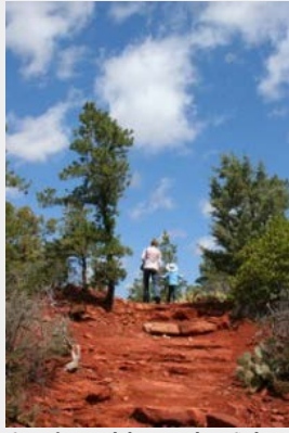
One of many hiking trails in Sedona.

Now that you've had a couple of days of relaxation, it's time to really see the landscapes of Sedona. One of the best ways to do this is with an off-road jeep tour via Pink Jeep Tours . We chose the Broken Arrow Tour and had a great time. I assumed we would be up in the mountains, following some sort of trail, but I could not have been more wrong! At times, we were practically vertical as we climbed huge, rounded boulders that I didn't believe our jeeps would climb – but they did!