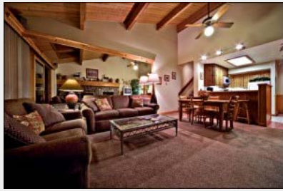
Inside a Junipine Resort creekhouse

We managed to make it through the mountains and the town of Sedona and up to the wonderful Junipine Resort , where we had booked a two-bedroom creekhouse. There are some wonderful hotels in Sedona but my advice is just to forget about them and book a stay at Junipine. It's