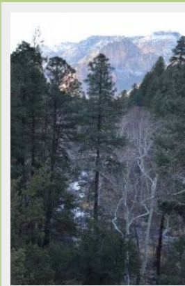
The view from our Junipine creekhouse.

absolutely the perfect place for a couple, group, or a family. With a choice of one or two bedrooms, a fully furnished kitchen, and a large living room with a fireplace, you can really relax and enjoy your time in Sedona. All of the creekhouses have wonderful views and many have luxurious hot tubs so you may never want to leave! Stock your kitchen with snacks and drinks or even the makings of a full meal and you can really save money on your vacation. Convenient hiking trails are located right near the property. And if you don't feel like cooking, just stroll over to the Junipine Café for a delicious, home-cooked meal.