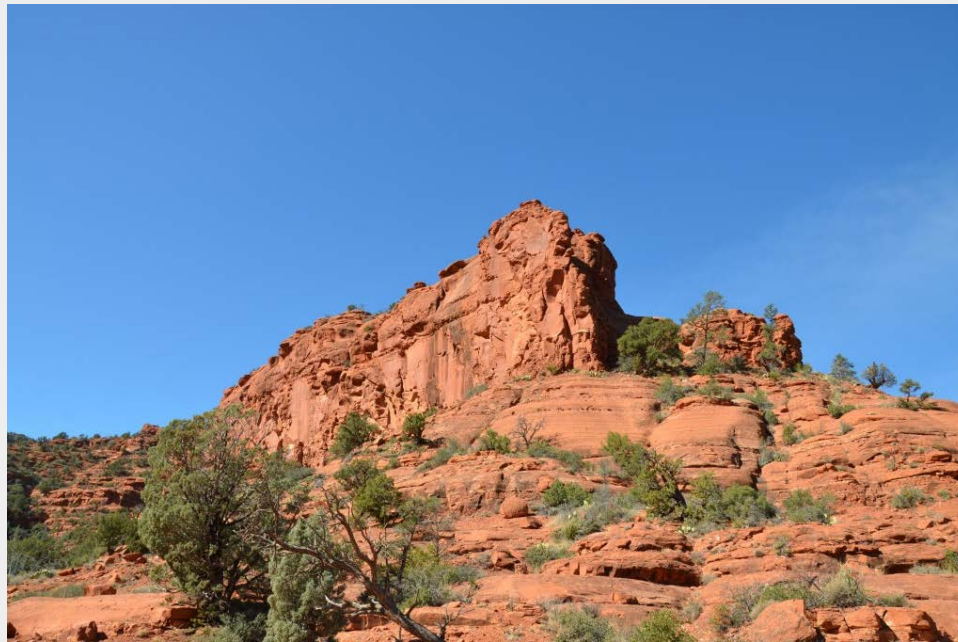
The red-rock Sedona Mountains.

The problem with driving to Sedona is that the scenery is so incredible, so mind-boggling, so truly unique and mesmerizing that you better plan to just pull over and experience it at some point or you are going to run right off the road.