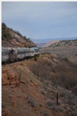
The Verde Canyon railroad

When you can tear yourself away from the fabulous surroundings in your creekhouse (we especially enjoyed the fireplace), head for a day to the Verde Canyon Railroad in nearby Clarkdale, Arizona. Only about half an hour from Sedona, it's well worth the drive. If you can, spring for first-class tickets so you can travel in the first class train where a very nice spread of free food awaits you. There are also very comfortable, cushy seats as well as love seats you can spread out on as you consume all the free brownies you can eat.