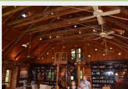
The Fontanel Great Room

One of the most interesting thing we did in Nashville was tour the Fontanel Mansion . There are plenty of mansions, homes, and estates to tour in Nashville and the surrounding areas, but this one is unique. A 27,000-foot log home on over 130 acres of land, the home was formerly owned by Barbara Mandrell. It's the largest log home in existence and is full of luxurious furnishings and country music memorabilia. After the tour, we had lunch at the Café Fontanella. But be sure to share that Stromboli if you order one because they are huge!