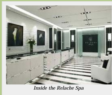
Inside the Relache Spa

You absolutely have to plan to spend a day at the incredible Relache Spa . I have been to plenty of spas but this was honestly the best spa experience I've ever had, mainly because of the superlative customer service. I usually don't do the steam room, sauna, etc., but this time I did because they actually took the time to explain the benefits. My husband had his first hot stone massage and was in absolute heaven. And my facial had me glowing for days. We worked out in the well-equipped fitness center and spent time lounging by the large indoor/outdoor pool. Both areas are just perfect.