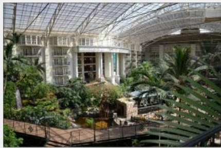
The view from our room!

After we checked in, we took one of the small Delta Riverboats that travel down a scenic river – inside the hotel, mind you! – through the four-to five-acre indoor garden as the guide gave us a tour of the hotel. It was a perfect introduction to the place and its truly mind-boggling size. If you go, check on the cruise times, but they run most days all day.