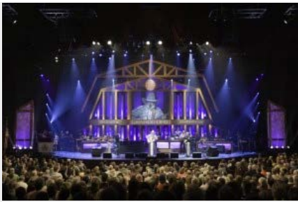
The Grand Ole Opry

With singers like little Jimmy Dickens, who is well into his 90s, and new, young talent performing every night, they manage to please every person in the audience. You can also sign up for a backstage tour, which is really interesting.