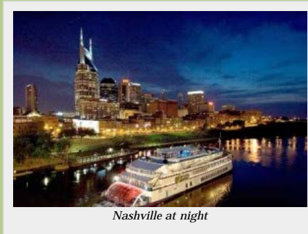
Nashville at night

The expansive Gaylord Opryland Resort and Convention Center was our first stop in Nashville and it's the perfect place to stay: It's right by the Grand ole Opry and close to downtown and all the music venues. We've stayed in hotels all over the world, but I have truly never seen a hotel quite like this one. Sprawling over nine acres covered with waterfalls, foliage, a winding river, a variety of restaurants and shops – all under a soaring glass atrium – you may never want to leave once you check in. We had a room with a balcony overlooking the scenery and fell asleep to the gentle white noise of the many waterfalls.