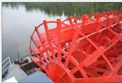
The 'General Jackson' paddlewheel

If you go, be sure to save one evening for a cruise on the General Jackson Showboat , another venue affiliated with the Gaylord Opryland Resort. We bought out tickets through the hotel and took the shuttle right to the riverboat landing. You can choose to just take the cruise and the show, but dinner is not that much more and it was surprisingly delicious. I really recommend you choose the whole package. The riverboat is an original paddle wheel steamer and the view of the Nashville skyline, all lit up at night, is quite amazing. The show was very professional and entertaining: They presented an overview of the history of country music in Tennessee in song and dance.