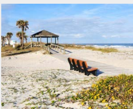
The beach on Amelia Island