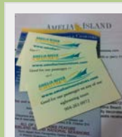
Tickets for our exciting cruise.

Aside from shopping and relaxing in our hotel, one of the most interesting things we did was to take a cruise of the area with Amelia River Cruises . We walked down to the harbor and boarded the very comfortable, shaded, large boat for the 10:30 a.m. cruise on the Cumberland Harbor. We were excited at the possibility of seeing wildlife along the way, including manatees and wild horses on Cumberland Island. Amelia and Cumberland islands have rich and interesting histories and the captain/narrator shares with you along the way.