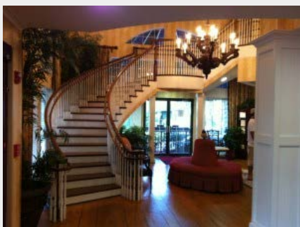
The beautiful staircase in the Inn's lobby.

One of the best places to stay on the island is The Hampton Inn and Suites Amelia Island in Fernandina Beach . We didn't know what to expect when pulled up to this lovely historic hotel located only about a block from the harbor and a short walk from the shopping district. But when we stepped into the gorgeous lobby, we were immediate fans. The lobby is beautifully decorated with hardwood floors, a fireplace, and an incredible staircase winding up to the next floor OO like something from Gone With the Wind . We thought the lobby could not be topped, but when we entered our large, one-bedroom suite we realized we were wrong. We were amazed to see a completely separate bedroom, a very nice living room, and a complete kitchen. It's the perfect place for a couple or even a family. There's even a nice-sized balcony