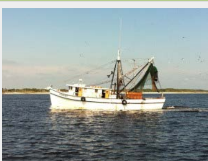
We passed a shrimp boat along our tour.

For dinner, we decided to check out Sandy Bottoms Beach Bar and Grill (don't you love that name?) and we were so glad we did. It was truly one of the best seafood dinners I have ever eaten and I am a seafood connoisseur. Located right on the beach, you can enjoy a great sunset while consuming some of the best hush puppies I've ever tasted. Seriously, you are going to want a double order.