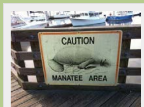
A sign at the dock

After relaxing by the hotel pool in the afternoon, we drove out to the beautiful beach area of the island. With a wide assortment of both huge and small beach houses and condos, it should be easy to find the perfect rental if you don't want to stay in a hotel. One of the nicest things we noticed is that there is a great deal of public beach access and plenty of free parking, which is very nice in a beach community.