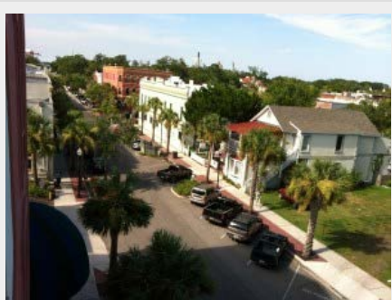
The view of the little town from our balcony.

I spent a couple of afternoons browsing through the shops and can recommend Twisted Sister , a fabulous little shop with clothes, décor, gifts and great jewelry. I bought bags full of reasonably priced jewelry, especially some with an ocean theme, which I love. If you love shells, you are going to love this place.