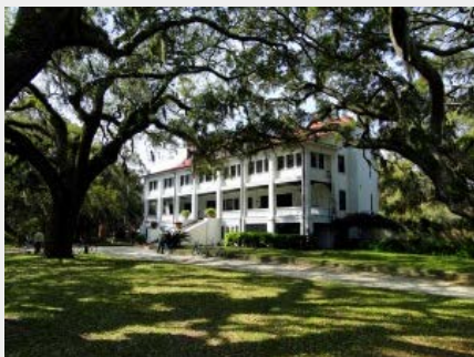
Greyfield Inn on Cumberland Island

From the Fernandina's beach area on Amelia Island to shrimp boats, historic Old Towne, and Fort Clinch (an interesting Civil War-era fort), this tour lets you see it all. We also caught sight of a quickly submerging manatee, but we were absolutely thrilled to see plenty of wild horses on Cumberland Island. I didn't know there were wild horses on any of the barrier islands except those off the coast of Virginia, but they are plentiful on Cumberland Island. The ruins of the Carnegie Dungeness Mansion on Cumberland were also fascinating. And we got a glimpse of the famous and beautiful Greyfield Inn where the Kennedys stayed after John F. Kennedy Jr. was married on Cumberland Island. The latter was his favorite place for vacations when he was a child.