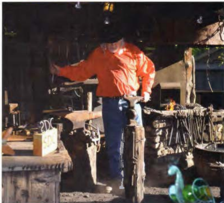
Silver Dollar City literally astonished us with the beautiful landscape, delicious foods and local artisans.

Surrounding the town of Branson are the soaring Ozarks and incredibly