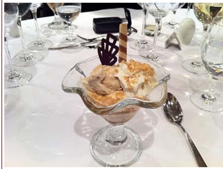
Another wonderful dessert!