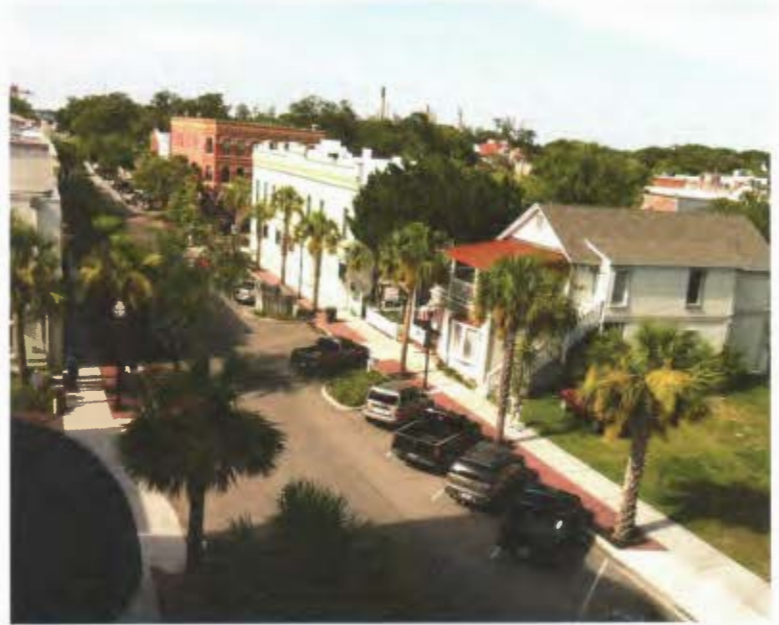
▲ View from our balcony.

The pretty downtown area of Fernandina Beach is complete with shops and restaurants, many of which look as though they have been there 100 years. Considering