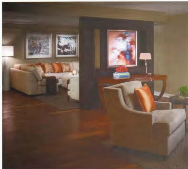
A suite at Sonesta, one of the nicest resorts on the island.

The beach at Hilton Head is amazing; it's absolutely huge at low tide with plenty of tide pools for kids to splash in and hard packed sand for bike riding. Most of the island is sublimely private, located inside gated communities and resorts but there are also several public beach access points. One of the nicest resorts on the island is the recently renovated Sonesta Resort. Beautifully redone with a