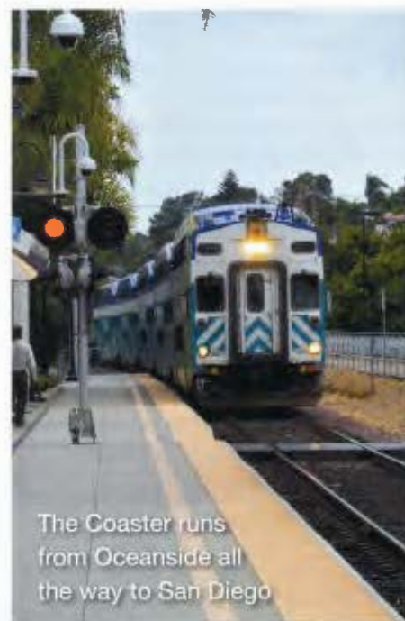
The Coaster runs from Oceanside all the way to San Diego

Don't forget to enjoy the beautiful beaches that Carlsbad has to offer. There are several public beaches in the area, so bring your beach chair and your picnic lunch and relax in this beautiful location.