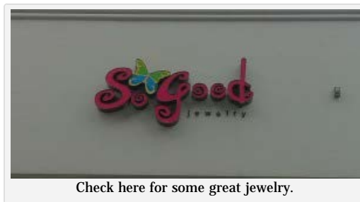
Check here for some great jewelry.

There are a lot of great shops with fabulous clothes, shoes and jewelry. If you are a lover of jewelry (as I am), pop in a little store called "So Good Jewelry" – there are actually two locations in Lincoln Road. It is a small shop absolutely packed with every kind and color of jewelry you can possibly dream of. I thought some of the prices were a trifle high for costume jewelry, but they did have a lot of things that were very reasonably priced, including a lovely little starfish necklace that made it home with me.