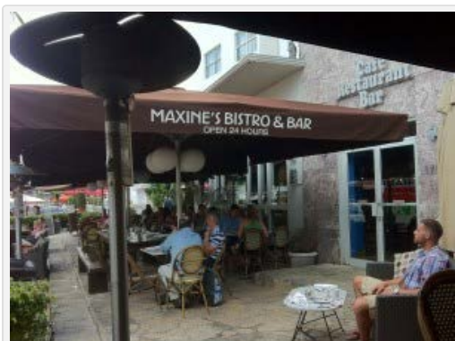
Great food at Maxine's!

the sand to admire the gorgeous shades of the water, as well as some bikinis so tiny they could easily be categorized as dental floss. Not on us, of course.