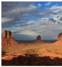
Five Offbeat Places to Soak Up the Southwest