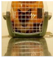
Putting Together a Pet Travel Kit

Tags: , Lincoln Road, Maxine's Bistro, SoBe Miami, South Beach Miami