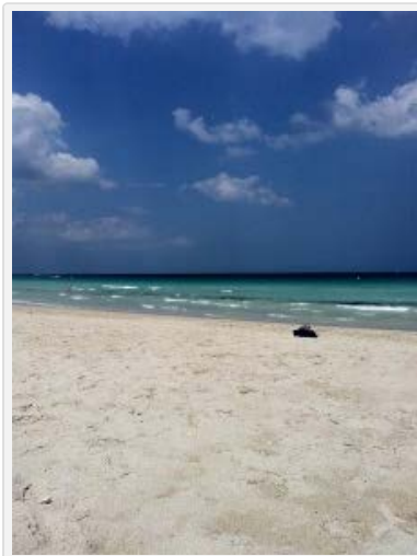
One of the beautiful SoBe beaches.

One of the most important things I learned when I was in South Beach, Miami for a day recently is that if you are "in the know" you call it SoBe . If you find yourself in SoBe for a day and you like to shop, eat and lounge on the beach, here's what I did to give you some ideas.