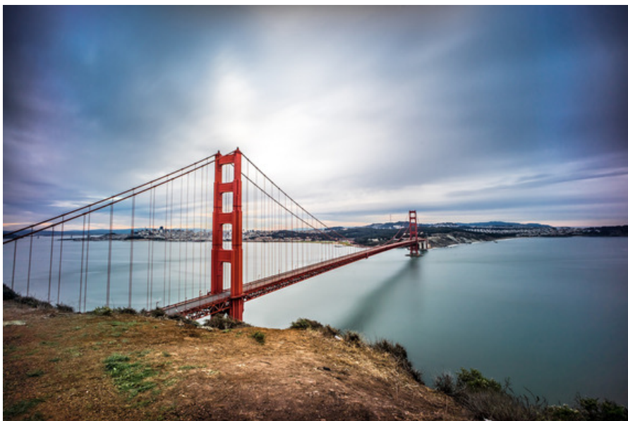
Golden Gate Bridge in San Francisco

Founded in 1776, a visit to San Francisco has to include the Golden Gate Bridge, opened in 1937. The Fairmont Heritage Place is a family-friendly hotel in Ghirardelli Square that serves a complimentary breakfast.