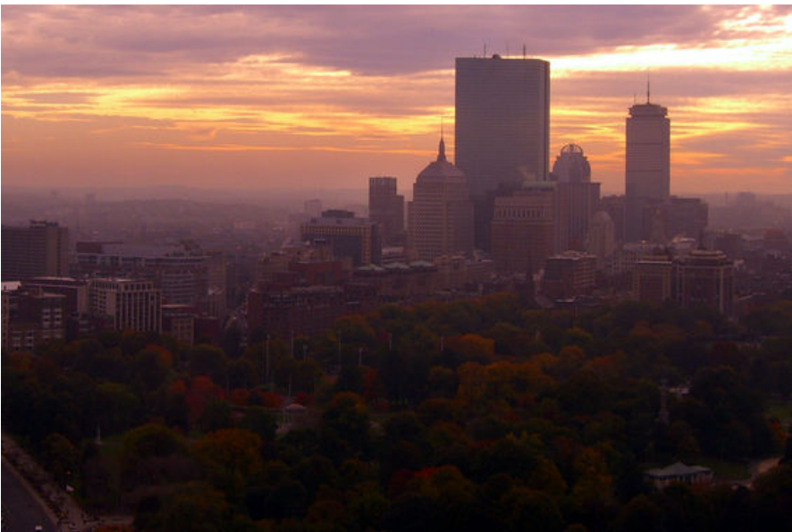
Boston, Massachusetts skyline

Posted: 10/12/2015 3:43 pm EDT | Updated: 10/12/2015 5:59 pm EDT