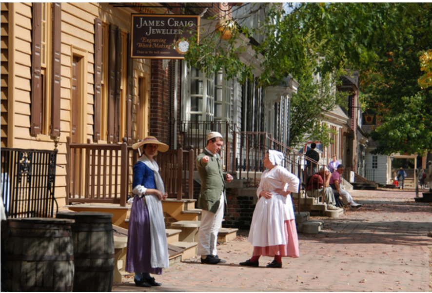
Colonial Williamsburg

Colonial Williamsburg is where you can find historically accurate buildings and costumed tour guides celebrating the origin of this city started in late 1600's. Nearby Jamestown is also a fascinating historical site and was the first permanent English colony.