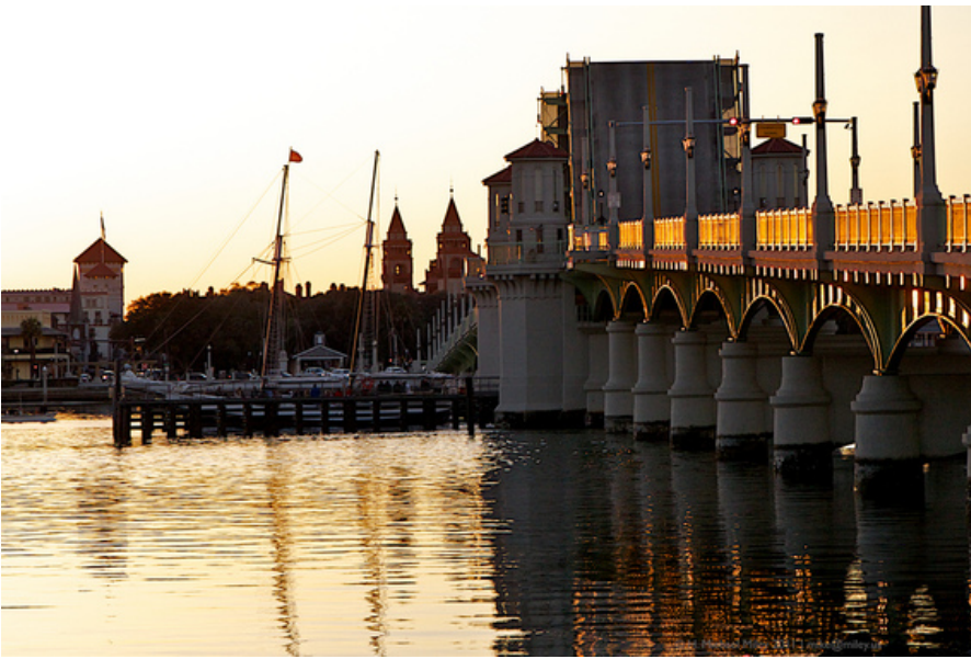
St. Augustine, Florida

Founded in 1565, the city is the oldest continuously occupied city in the United States. For an introduction to the history of the area, visit Fort Mose State Park, which is on the site of an 18th century fort, as well as the St. Augustine Lighthouse, which was built in 1874 and provides a great view of the area. The Casa Monica Hotel is a Spanish-inspired family-friendly hotel with suites and a rooftop pool.